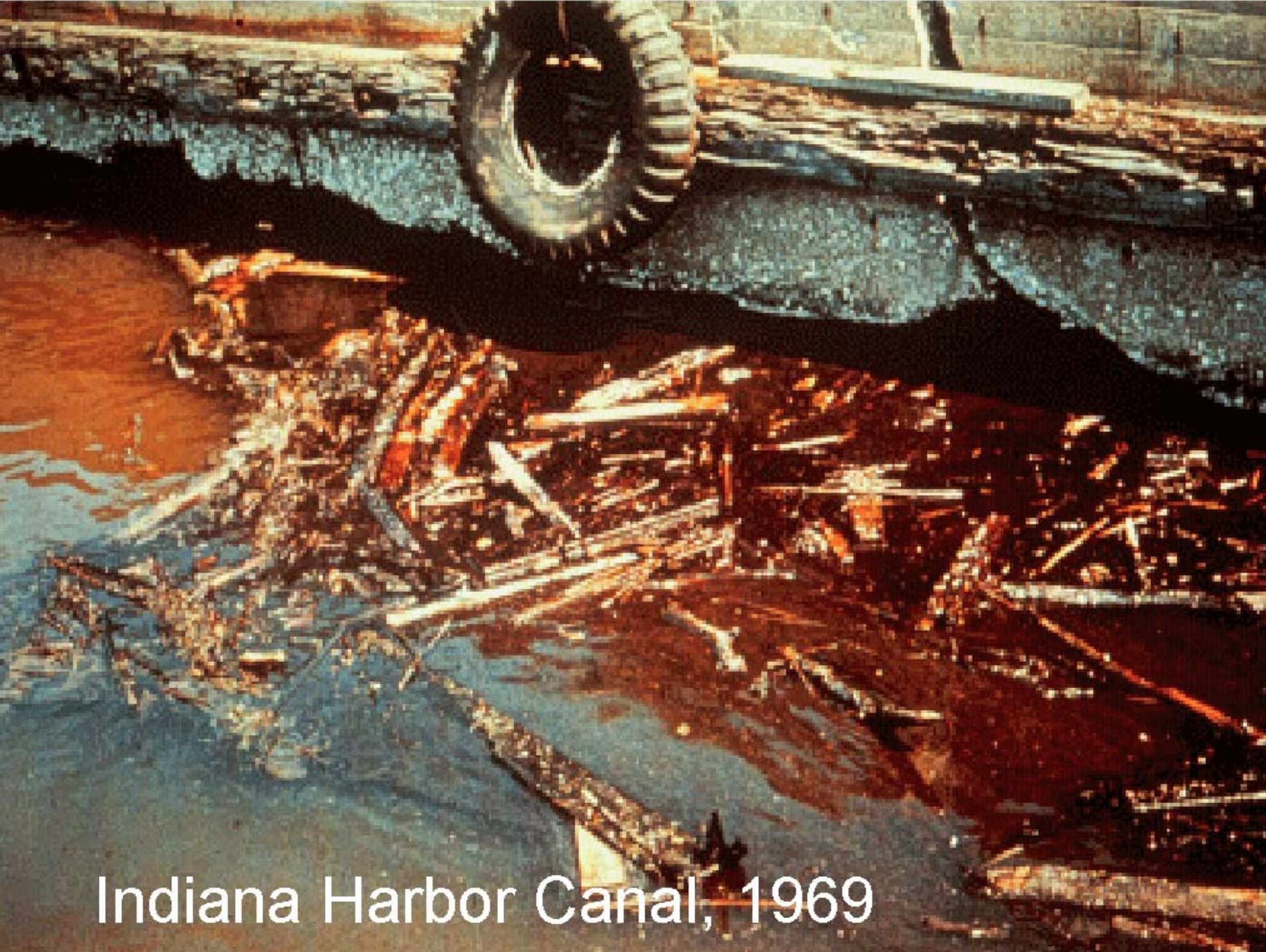
Indiana Harbor Canal, 1969