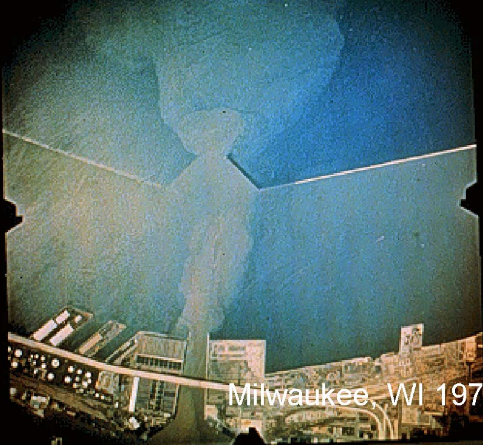
Milwaukee, WI 1977