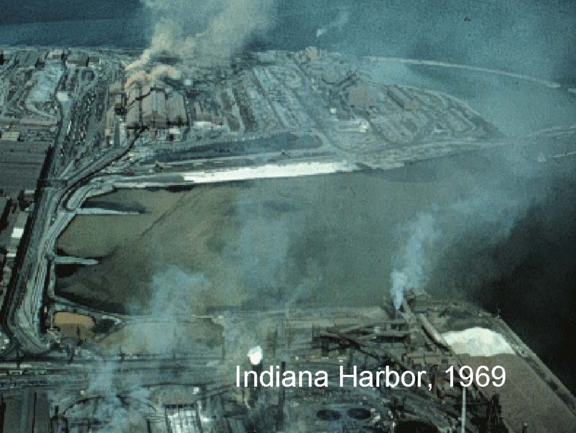
Indiana Harbor, 1969