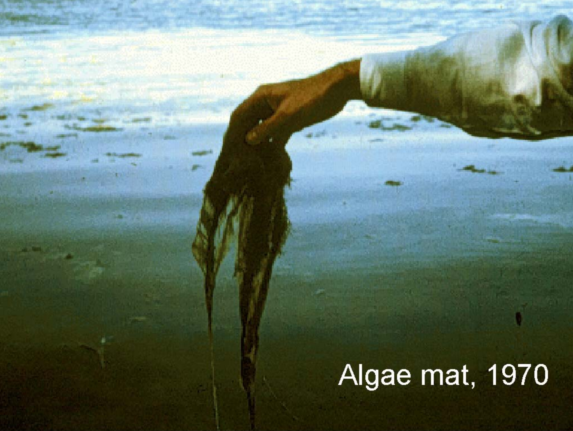
Algae mat, 1970