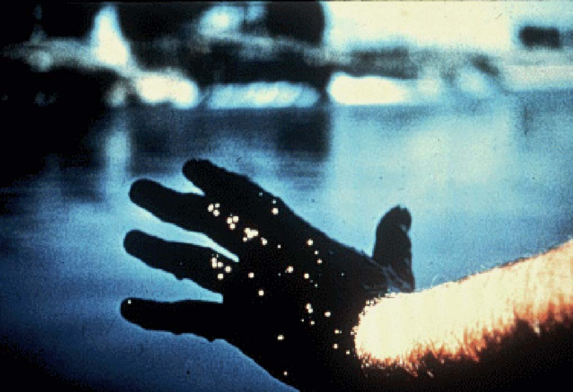
Grand Calumet River, IN 1970