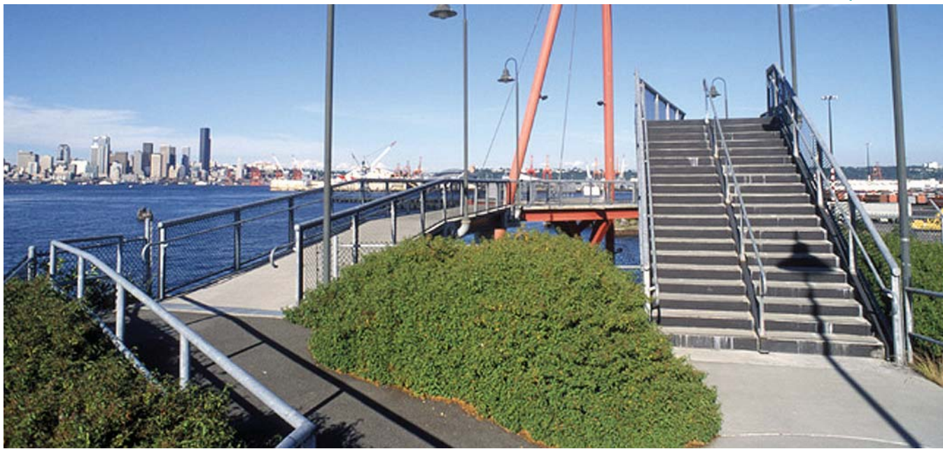
People can watch the cleanup of Pacific Sound Resources from the public-access park and viewing tower at the site.