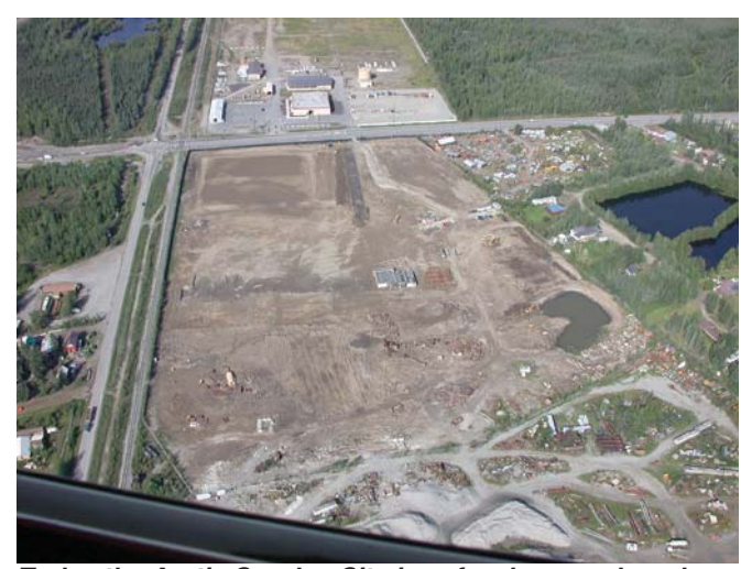
Today the Arctic Surplus Site is safe, clean, and ready for industrial redevelopment.

To make the site available for a wide variety of future activities, EPA approved a redesigned cap for the onsite hazardous waste containment area. Due to EPA's modifications, the property owner can now use this area for parking, storage, and other business needs.