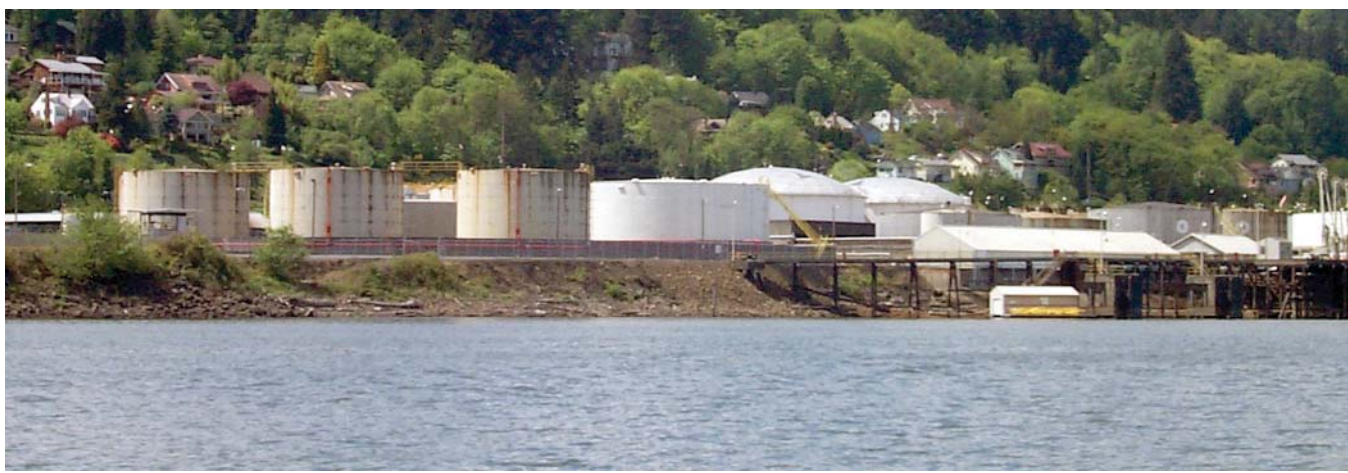
EPA will use fish tissue data to help determine sediment cleanup levels at Portland Harbor.

Progress at Portland Harbor stems from close teamwork on many fronts. EPA and the Oregon Department of Environmental Quality are cooperating with citizens, tribes, and public agencies to ensure that the investigation incorporates a wide range of concerns. Six tribes and several federal and state agencies work in partnership with EPA to resolve technical issues regarding work plans and collection of sediment samples.