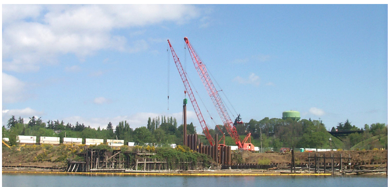
The sub-surface barrier wall at McCormick and Baxter will prevent toxic substances from seeping into the Willamette River.

EPA took fast action to secure and stabilize the site by controlling water accumulation and covering open containers filled with cyanide and hydrofluoric acid. The Agency has pumped storm water into above-ground tanks. It also removed and properly disposed of approximately 70,000 gallons of hazardous waste liquids. The Fire Marshall's office expressed satisfaction with EPA's quick response. The site no longer poses a threat to neighbors and workers, and EPA is helping to put the site back into productive use.