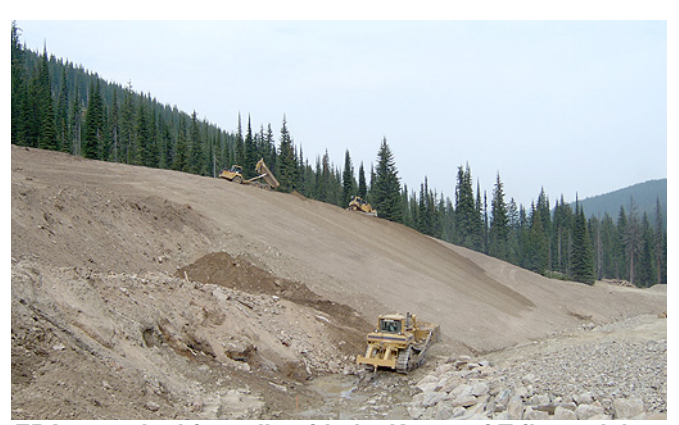
EPA consulted formally with the Kootenai Tribe and the Canadian government to complete a rapid cleanup of Continental Mine.

EPA has completed a 5-month cleanup of the Continental Mine, which sits on both public and private land near the Canadian border in northwest Idaho. The mine is in the pristine Selkirk Mountain ecosystem, home to many rare species, including bald eagles, Canadian lynxes, grey wolves, grizzly bears, caribou, sturgeon, and bull trout. As a result of the cleanup, 138,000 cubic yards of material contaminated with mine