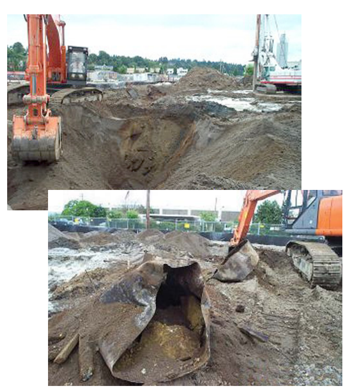
Prior to cleanup, soils at Frontier Hard Chrome were stained with contamination.

EPA has completed cleanup of hexavalent chromium at the Frontier Hard Chrome Superfund site in Vancouver. Years of improper chrome disposal had contaminated groundwater and threatened the Columbia River. Today, the property is fenced and ready for light industrial or commercial reuse. By using innovative cleanup technologies, EPA spent $3.5 million, rather than the projected $30 million it could have spent using traditional methods.