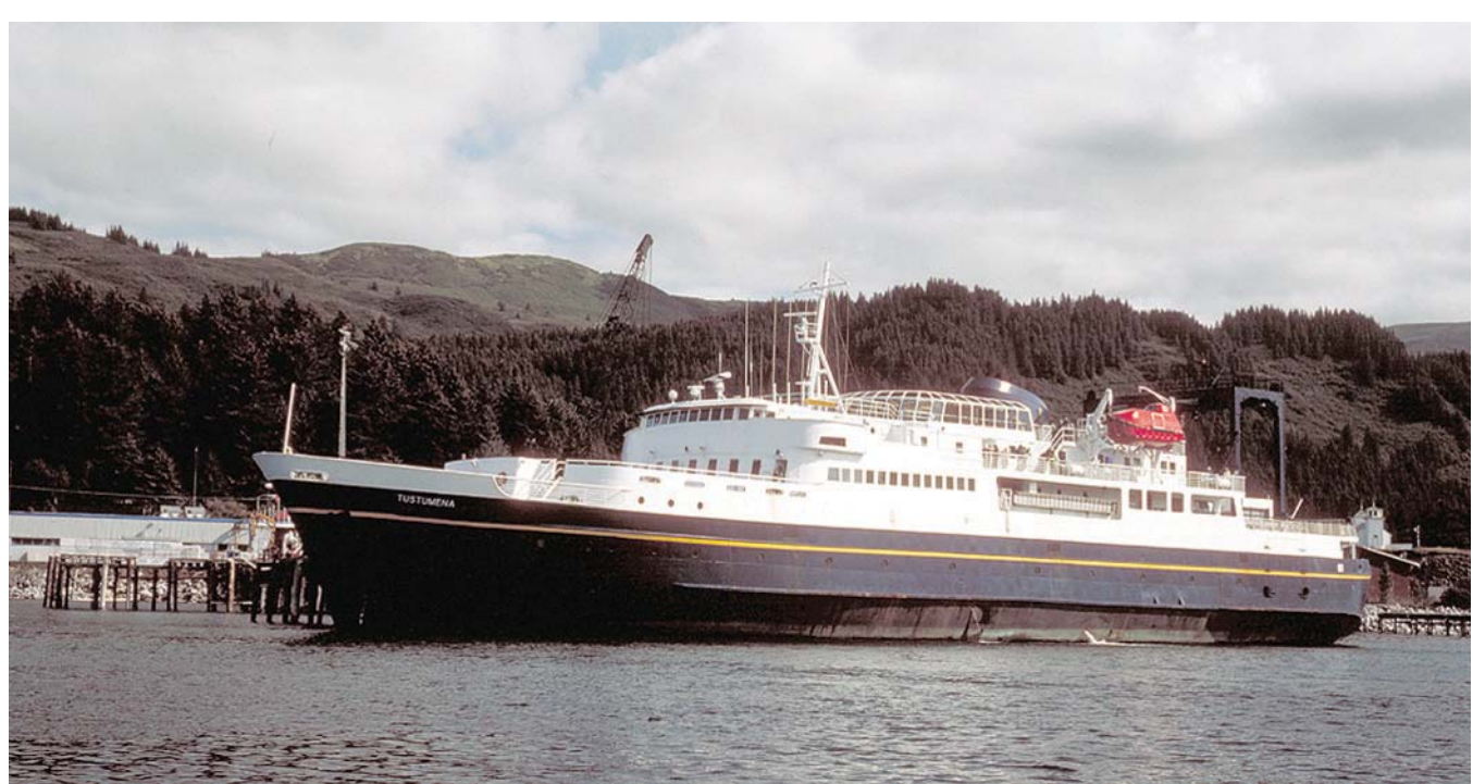
Adak's ice-free, deep-water port invites commercial growth.

Completing the first phase of unexploded ordinance cleanup was an important step in making the Adak property transfer possible. The Navy removed 351 intact military munitions from WWII, including grenades, mortars, and projectiles. It also removed 3,300 metal fragments from training areas, including partially intact munitions that did not completely explode after being fired. The first cleanup phase addressed all of downtown Adak and all the real estate scheduled for transfer. EPA's collaboration with the Navy, the Aleut Tribes, the State, local business, and the community has been critical to expediting the cleanup and making the island safer for everyone.