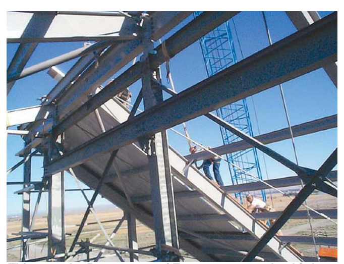
This year the Department of Energy cocooned a third nuclear reactor.

The Department of Energy finished cocooning a third nuclear reactor at the 586-square-mile Hanford Nuclear Reservation, which is the most contaminated nuclear waste site in the United States and the site of the world's largest environmental cleanup. Cocooning involves tearing the reactor down to the 3-foot concrete shield wall, and putting a safe, secure structure of galvanized steel on top of it.