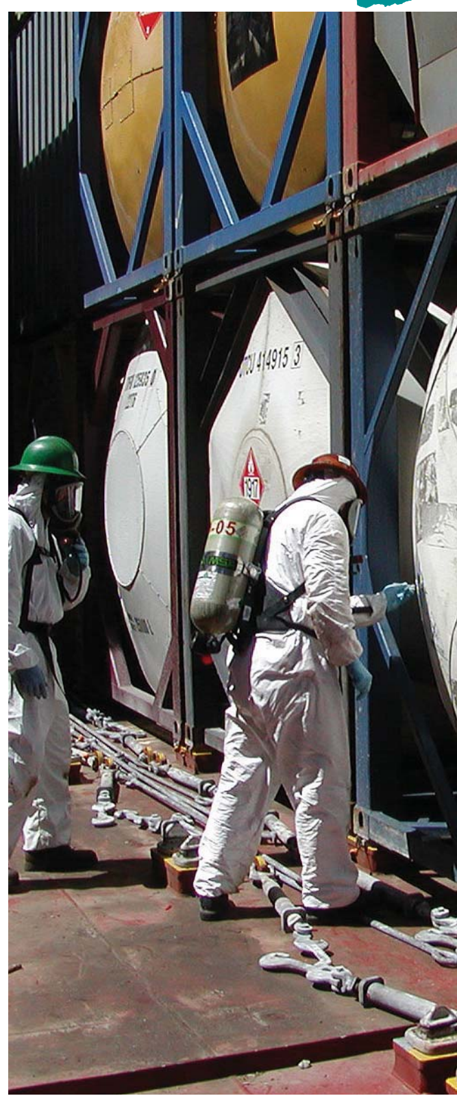
EPA monitors vapors on the Axel Maersk cargo ship to protect Port of Tacoma employees and the surrounding community.

When EPA staff arrived on board, they helped to find, isolate, and contain the source of the hazard. EPA also monitored the air to protect Port employees and the surrounding community. EPA and the Coast Guard determined that one of the containers on the ship released vapors due to high internal pressure. EPA helped move the container to a quarantined area on the dock for re-certification. Due to the fast response by all parties, the Axel Maersk was able to resume business and leave Tacoma three days after the incident.