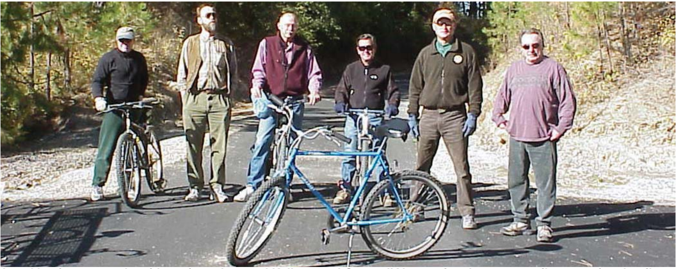
Local businesses and residents in and around Kellogg and Coeur d'Alene enjoy the new 72-mile recreational trail.

wastes have been consolidated on site under a protective barrier. The barrier is minimizing the release of lead and arsenic into Blue Joe Creek. To protect fisheries, state and federal agencies will monitor water quality for several years.