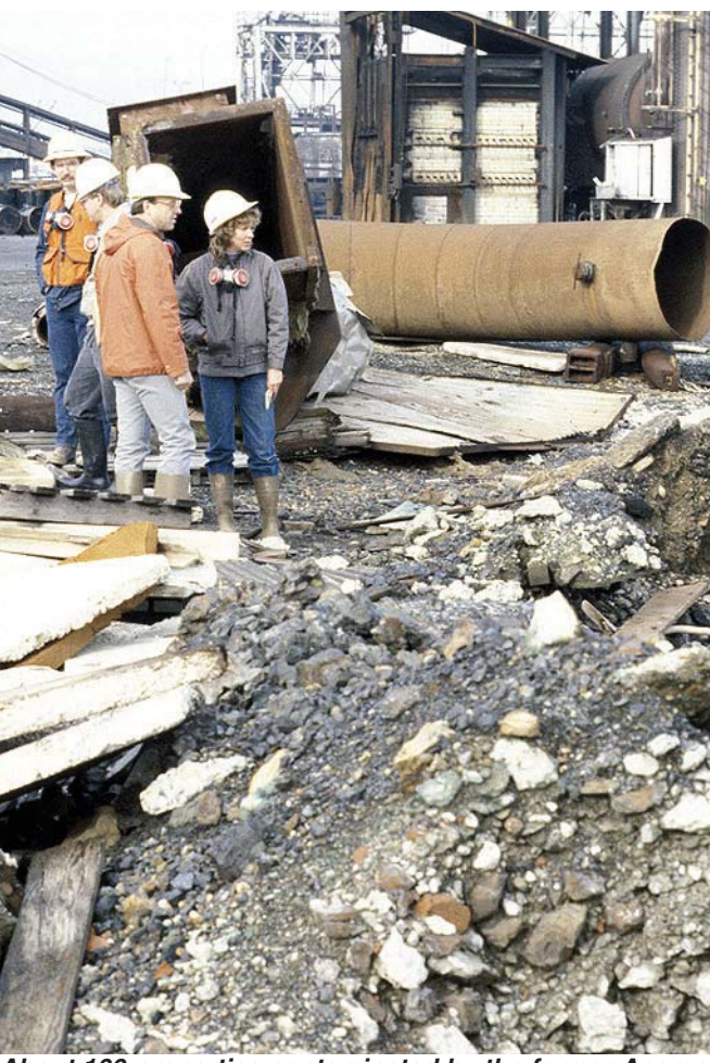
About 100 properties contaminated by the former Asarco smelter will be cleaned up in 2004.

With EPA assistance, the Justice Department reached an agreement with Asarco to fund an independent environmental trust to be used for the next seven years to pay for cleanup of sites around the country where Asarco is liable. Initial funding of the trust is more than $100 million. The trust fund is a major achievement because Asarco had been struggling financially due to low copper prices. Further complicating the settlement is the fact that Asarco is now fully owned by Grupo Mexico, a Mexican corporation.