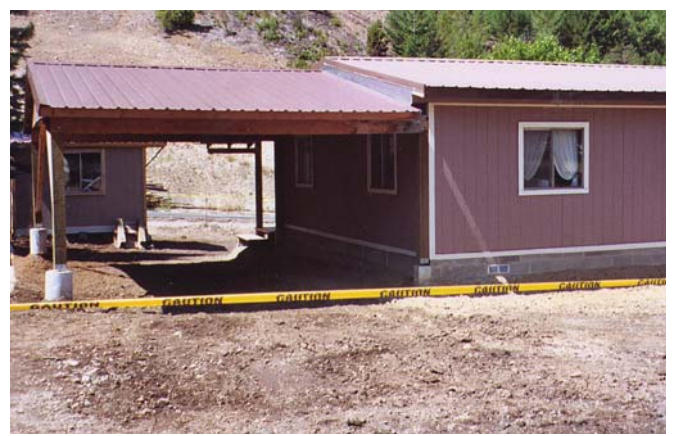
Many homes are having contaminated topsoil replaced with safer materials.

Cleanup of Bunker Hill Operable Unit 3 (the Basin) has been a top priority for EPA since the cleanup plan was finalized in 2002. This past year, planning began for cleanups at two Lower Basin recreation areas, as approved under the Basin Commission's first one-year work plan. The Basin Commission is a team of representatives from the states of Idaho and Washington, three counties in the Basin, the Coeur d'Alene Tribe, and federal agencies. The Commission's objective is to establish clean and low-maintenance recreation sites for public use.