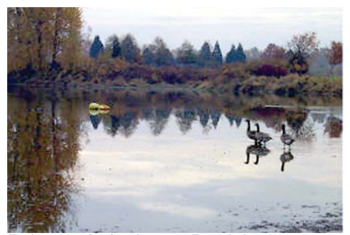
Toxic contamination threatens Force Lake.

In September 2003, EPA added the Harbor Oil site to the National Priorities List, making it Oregon's newest Superfund site. The site is located near the Expo Center in northeast Portland. The Oregon Department of Environmental Quality referred the site to EPA when it was unable to reach a cleanup agreement with the owner. In deciding to list the site, EPA considered input from the community, tribes, and state and local agencies.