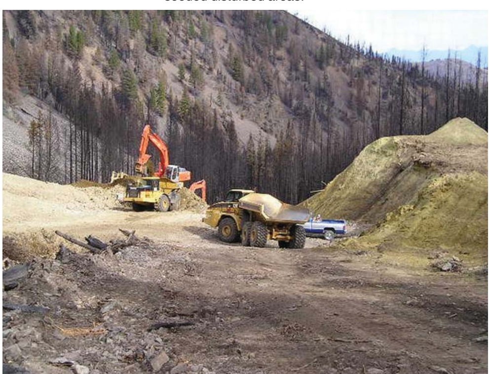
A fast cleanup at the Harmony Mine protects downstream waters from copper contamination.

In just two months, EPA and the U.S. Forest Service co-led a $500,000 cleanup to remove the tailings, place them in a secure repository, and cap them. The agencies built a 1.3 mile road so that large construction equipment could get to the site. They also reconstructed the stream channel to be stable and seeded disturbed areas.