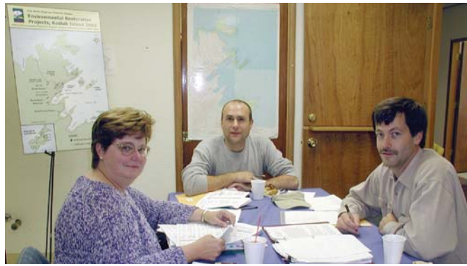
Staff from EPA, the Army Corps, and the Alaska Department of Environmental Conservation discuss prioritizing cleanups at FUD sites.

In a landmark bargain for progress, EPA Region 10, the U.S. Army Corps, and the Alaska Department of Environmental Conservation crafted and signed the first Statewide Management Action Plan for prioritizing cleanups at the 625 Formerly Used Defense Sites (FUDS) across Alaska. Implementing the action plan will produce several tangible results: the agencies will be much more strategic and productive in their cleanup approach; sites posing the highest risks to communities will be addressed more quickly; and due to greater efficiencies, taxpayer dollars will be saved.