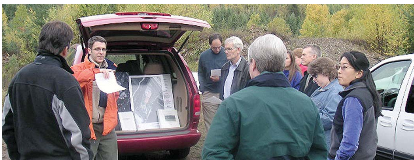
EPA employees discuss cleanup in the Coeur d'Alene Basin.

In non-populated areas of the Box, work is nearly complete. Revegetation efforts have been extremely effective. New plants and animals are flourishing in areas that have been devoid of life for decades.