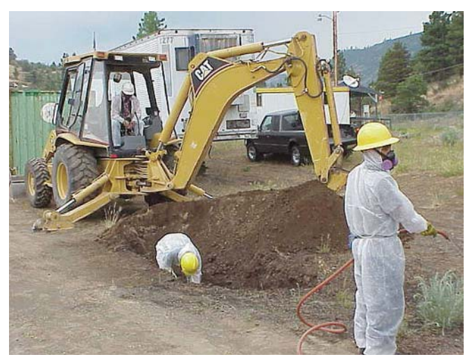
EPA takes fast action to remove asbestos from the North Ridge Estates neighborhood.

In summer 2003, EPA took action to remove asbestos contamination from 22 residences in the North Ridge Estates neighborhood near Klamath Falls. The Oregon Department of Environmental Quality asked EPA to get involved when it learned that asbestos-laden debris throughout the subdivision could threaten the health of residents. EPA's work included removing more than