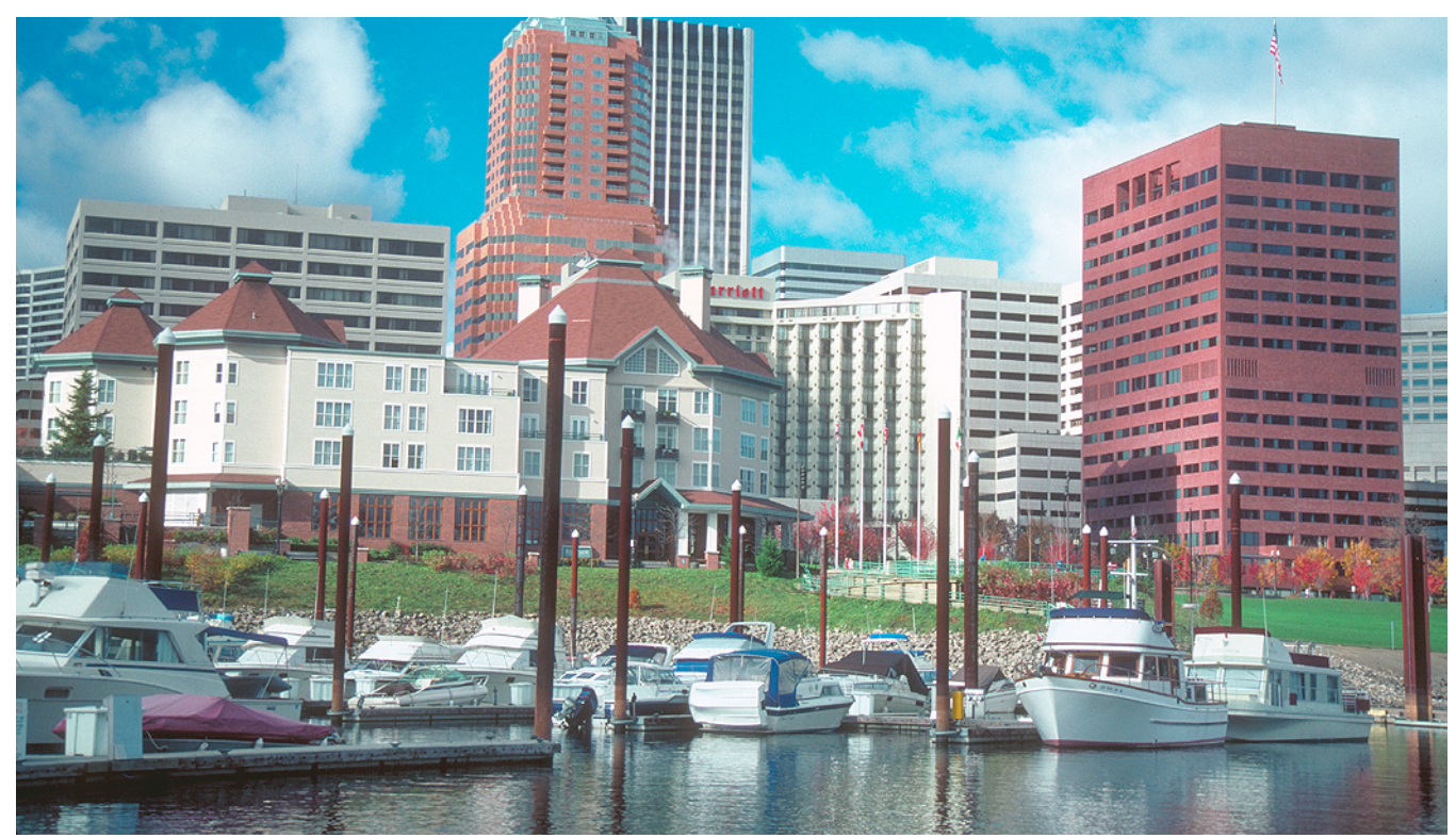
The Willamette River is an aesthetic and recreational highlight for Oregon.

Tasks planned in the final cleanup phase include installing 15 groundwater circulation wells, constructing a clean soil cap, and restoring a wetland. The circulation wells will remove volatile organic compounds and prevent contamination from spreading off site. The soil cap will be spread two feet deep over an area larger than 12 football fields. It will protect future occupants from exposure to coal-tar compounds and PCBs. The wetland will provide habitat for endangered species.