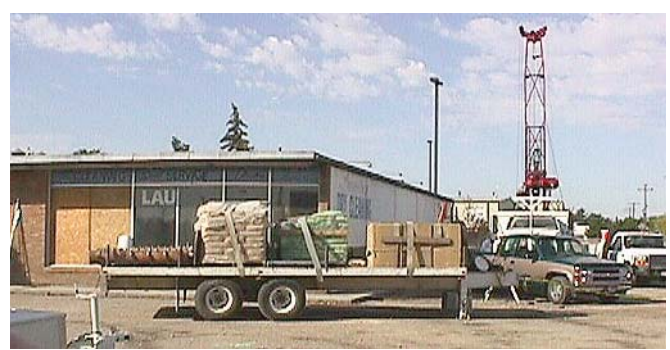
The results of a rapid investigation at Franke's Laundromat are helping EPA and others determine next steps.

In Spring 2003, EPA negotiated a legal agreement with the property owner of Franke's Laundromat to do a rapid site investigation. EPA got involved due to dangerous levels of perchloroethylene (PCE) in soil and groundwater at the site. Since PCE is highly toxic