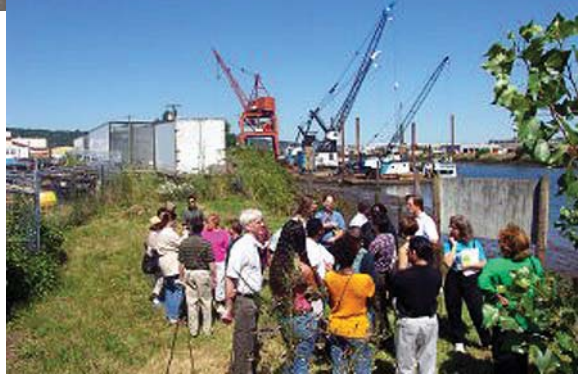
Top Left: In May 2003, chinook salmon were collected from the Lower Duwamish Waterway and tested for contamination.

Lower Right: Government agencies tour the Duwamish area with the Community Coalition for Environmental Justice.