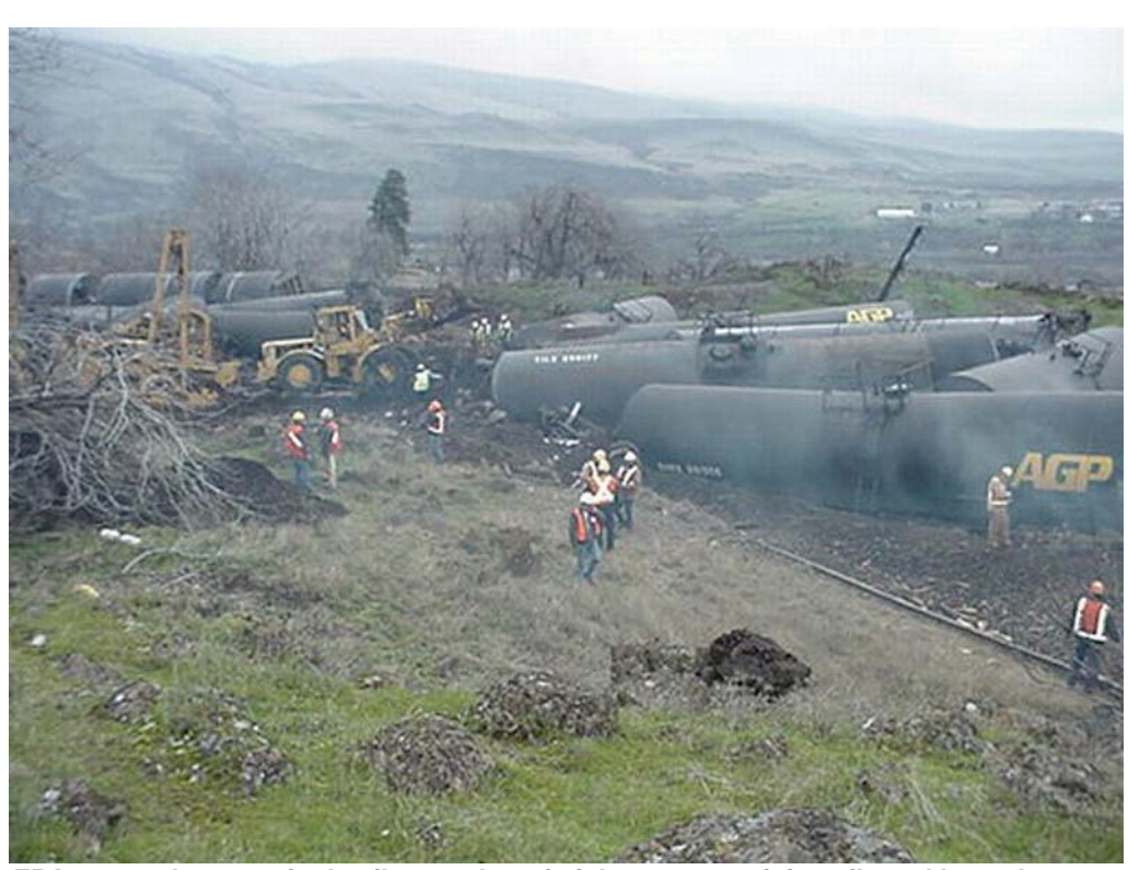
EPA responds at a train derailment where freight cars containing oils and hazardous materials jumped the track.

The derailment occurred in a culturally significant area within the Columbia Gorge National Scenic Area. The Yakima, Warm Springs, and Umatilla Indian tribes have cultural and historic connections to the area. During the cleanup, the Unified Command made sure that culturally and historically significant items weren't disturbed. At the tribes' request, EPA also made sure that soils removed from the site were returned after they were treated.