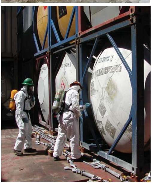
Bottom left cover photo contributed by Dan Rone.