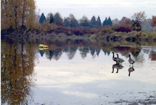
Toxic contamination threatens Force Lake.

In September 2003, EPA added the Harbor Oil site to the National Priorities List, making it Oregon's newest Superfund site. The site is located near the Expo Center in northeast Portland. The Oregon Department of Environmental Quality referred the site to EPA when it was unable to reach a cleanup agreement with the owner. In deciding to list the site, EPA considered input from the community, tribes, and state and local agencies.