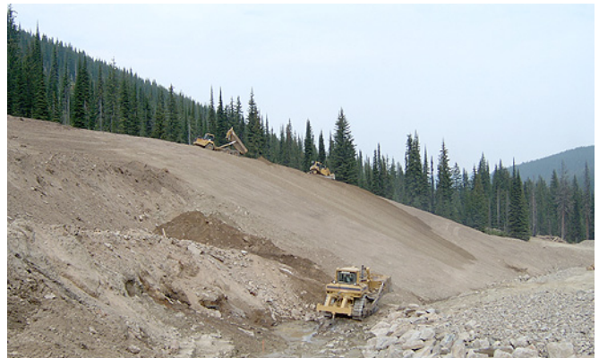
EPA consulted formally with the Kootenai Tribe and the Canadian government to complete a rapid cleanup of Continental Mine.

EPA has worked closely with the State of Idaho and the Coeur d'Alene Tribe on this project. In addition to cleaning up contaminated sites along the railway, the project has involved building or repairing 30 bridges and constructing solar-powered, composting toilets.