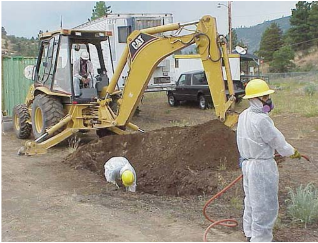
EPA takes fast action to remove asbestos from the North Ridge Estates neighborhood.

In summer 2003, EPA took action to remove asbestos contamination from 22 residences in the North Ridge Estates neighborhood near Klamath Falls. The Oregon Department of Environmental Quality asked EPA to get involved when it learned that asbestos-laden debris throughout the subdivision could threaten the health of residents. EPA's work included removing more than 14,000 pounds of asbestos-containing materials from residential properties, and sampling air and soil to see if people were at risk.