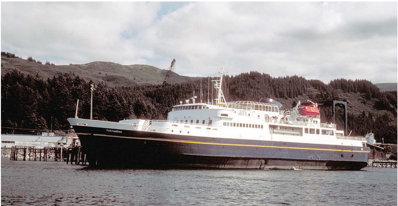
Adak's ice-free, deep-water port invites commercial growth.

Completing the first phase of unexploded ordnance cleanup was an important step in making the Adak property transfer possible. The Navy removed 351 intact military munitions from WWII, including grenades, mortars, and projectiles. It also removed 3,300 metal fragments from training areas, including partially intact munitions that did not completely explode after being fired. The first cleanup phase addressed all of downtown Adak and all the real estate scheduled for transfer. EPA's collaboration with the Navy, the Aleut Tribes, the State, local business, and the community has been critical to expediting the cleanup and making the island safer for everyone.