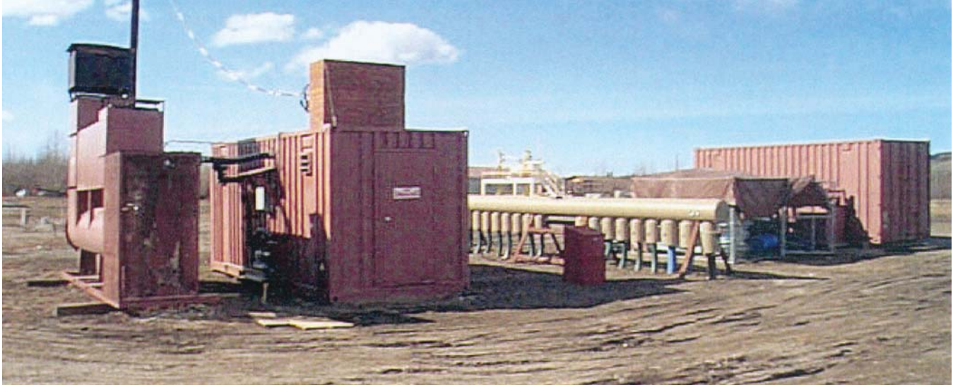
Work at Fort Wainwright has stimulated the local economy, as local contractors are doing the bulk of cleanup.