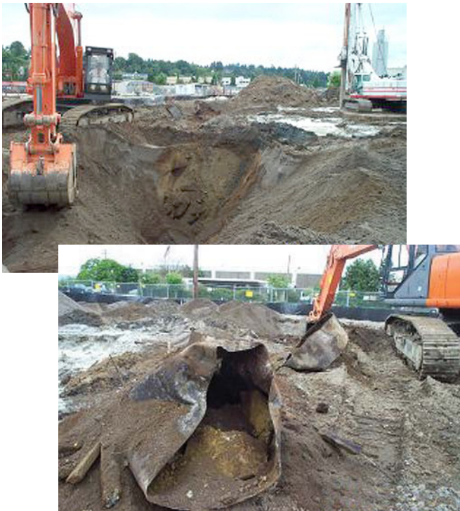
Prior to cleanup, soils at Frontier Hard Chrome were stained with contamination.

EPA has completed cleanup of hexavalent chromium at the Frontier Hard Chrome Superfund site in Vancouver. Years of improper chrome disposal had contaminated groundwater and threatened the Columbia River. Today, the property is fenced and ready for light industrial or commercial reuse. By using innovative cleanup technologies, EPA spent $3.5 million, rather than the projected $30 million it could have spent using traditional methods.