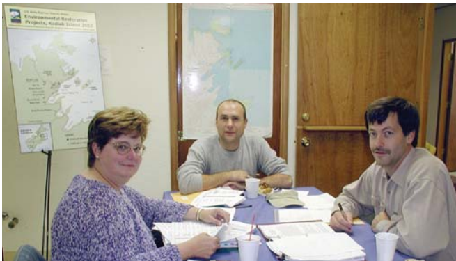
Staff from EPA, the Army Corps, and the Alaska Department of Environmental Conservation discuss prioritizing cleanups at FUD sites.

In a landmark bargain for progress, EPA Region 10, the U.S. Army Corps, and the Alaska Department of Environmental Conservation crafted and signed the first Statewide Management Action Plan for prioritizing cleanups at the 625 Formerly Used Defense Sites (FUDS) across Alaska. Implementing the action plan will produce several tangible results: the agencies will be much more strategic and productive in their cleanup approach; sites posing the highest risks to communities will be addressed more quickly; and due to greater efficiencies, taxpayer dollars will be saved.