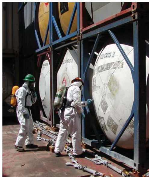
Bottom left cover photo contributed by Dan Rone.