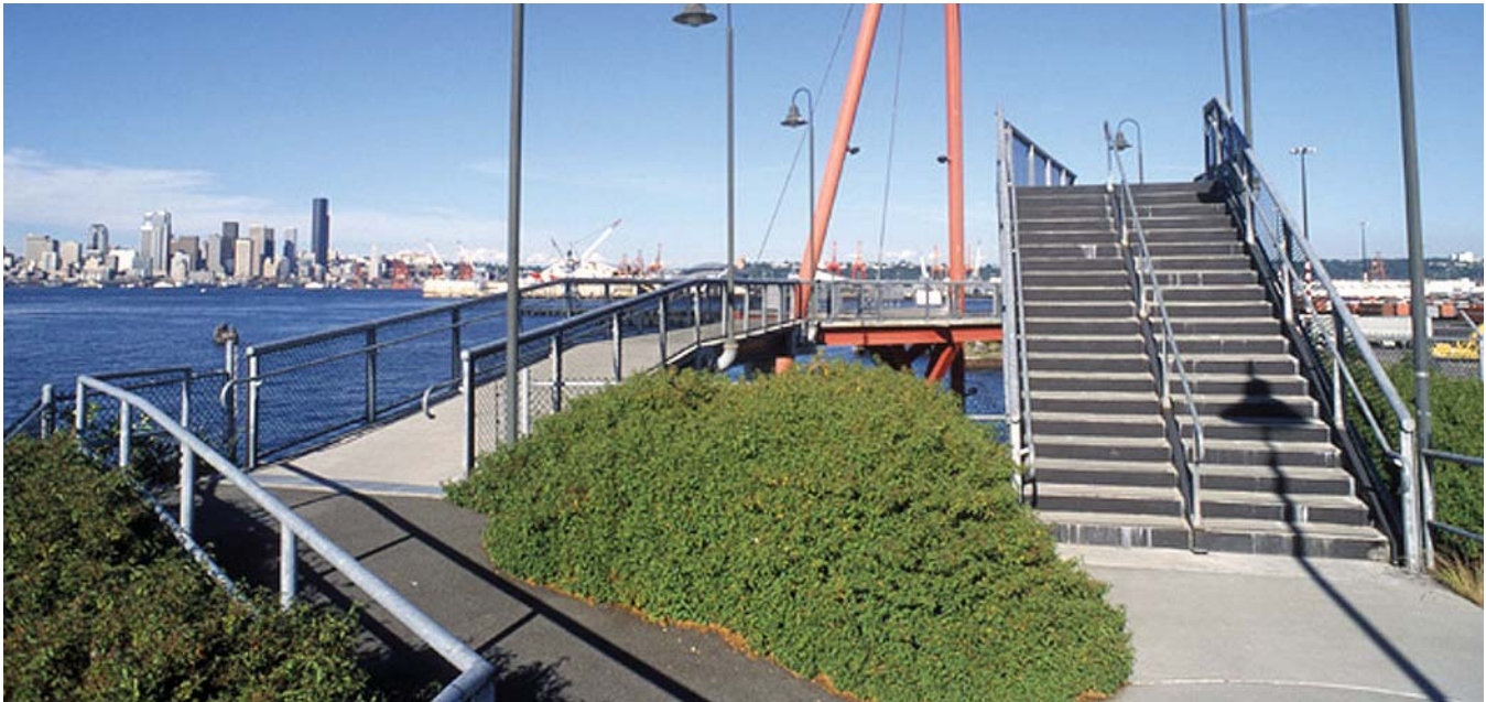
People can watch the cleanup of Pacific Sound Resources from the public-access park and viewing tower at the site.