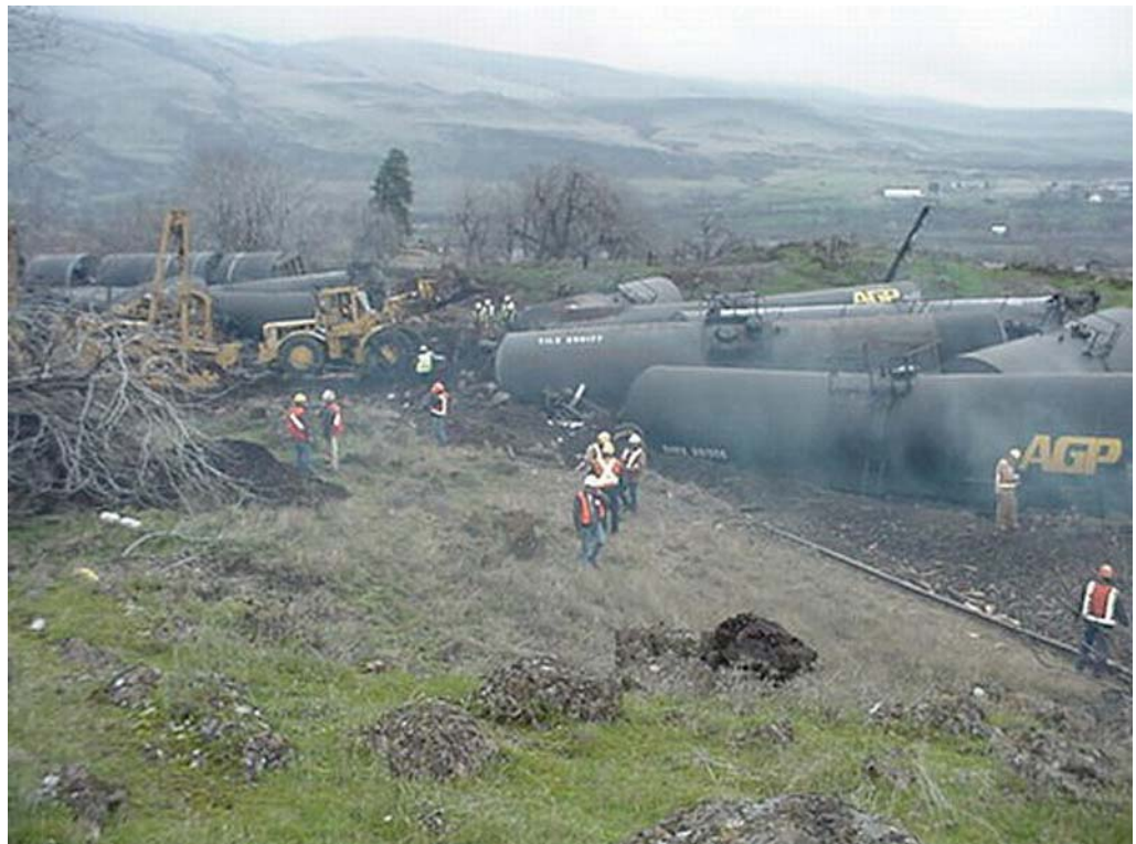
EPA responds at a train derailment where freight cars containing oils and hazardous materials jumped the track.

The derailment occurred in a culturally significant area within the Columbia Gorge National Scenic Area. The Yakima, Warm Springs, and Umatilla Indian tribes have cultural and historic connections to the area. During the cleanup, the Unified Command made sure that culturally and historically significant items weren't disturbed. At the tribes' request, EPA also made sure that soils removed from the site were returned after they were treated.