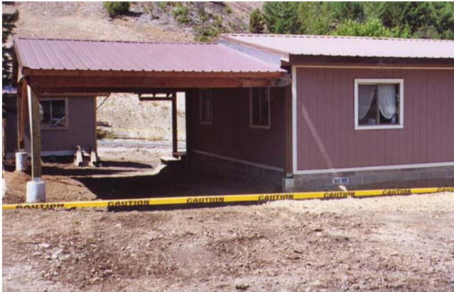
Many homes are having contaminated topsoil replaced with safer materials.

Cleanup of Bunker Hill Operable Unit 3 (the Basin) has been a top priority for EPA since the cleanup plan was finalized in 2002. This past year, planning began for cleanups at two Lower Basin recreation areas, as approved under the Basin Commission’s first one-year work plan. The Basin Commission is a team of representatives from the states of Idaho and Washington, three counties in the Basin, the Coeur d’Alene Tribe, and federal agencies. The Commission’s objective is to establish clean and low-maintenance recreation sites for public use.