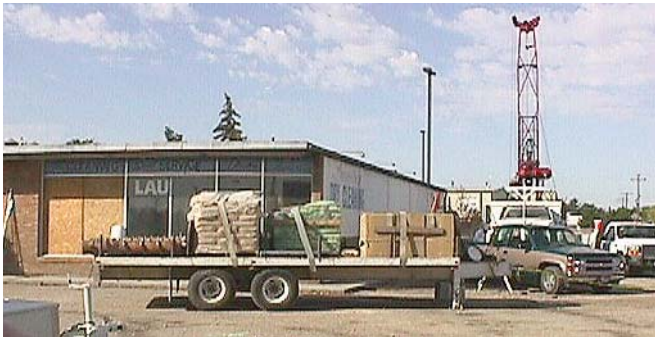
The results of a rapid investigation at Franke's Laundromat are helping EPA and others determine next steps.

In Spring 2003, EPA negotiated a legal agreement with the property owner of Franke's Laundromat to do a rapid site investigation. EPA got involved due to dangerous levels of perchloroethylene (PCE) in soil and groundwater at the site. Since PCE is highly toxic and a probable carcinogen, EPA is concerned about off-site migration and the threat to down-gradient drinking water and the air inside nearby businesses.