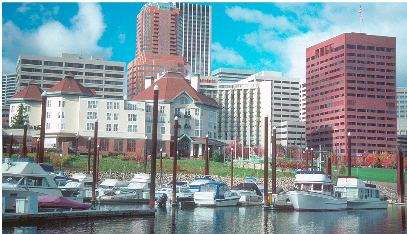
The Willamette River is an aesthetic and recreational highlight for Oregon.

Tasks planned in the final cleanup phase include installing 15 groundwater circulation wells, constructing a clean soil cap, and restoring a wetland. The circulation wells will remove volatile organic compounds and prevent contamination from spreading off site. The soil cap will be spread two feet deep over an area larger than 12 football fields. It will protect future occupants from exposure to coal-tar compounds and PCBs. The wetland will provide habitat for endangered species.