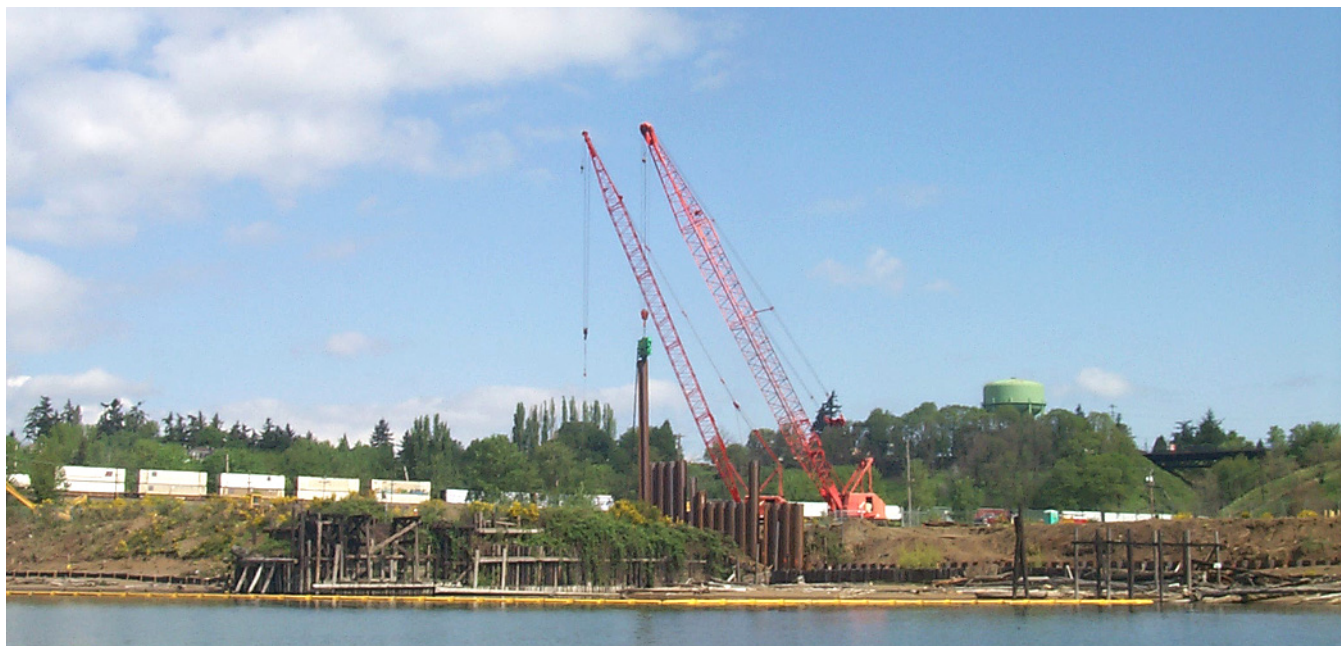
The sub-surface barrier wall at McCormick and Baxter will prevent toxic substances from seeping into the Willamette River.

EPA took fast action to secure and stabilize the site by controlling water accumulation and covering open containers filled with cyanide and hydrofluoric acid. The Agency has pumped storm water into above-ground tanks. It also removed and properly disposed of approximately 70,000 gallons of hazardous waste liquids. The Fire Marshall's office expressed satisfaction with EPA's quick response. The site no longer poses a threat to neighbors and workers, and EPA is helping to put the site back into productive use.