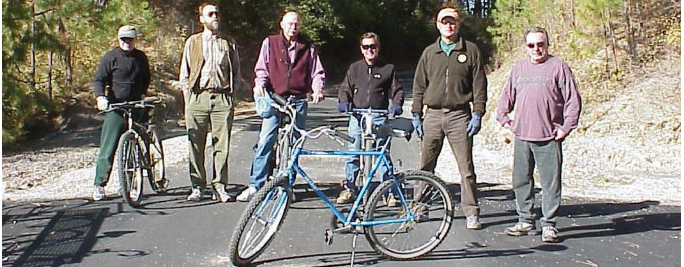
Local businesses and residents in and around Kellogg and Coeur d'Alene enjoy the new 72-mile recreational trail.

wastes have been consolidated on site under a protective barrier. The barrier is minimizing the release of lead and arsenic into Blue Joe Creek. To protect fisheries, state and federal agencies will monitor water quality for several years.