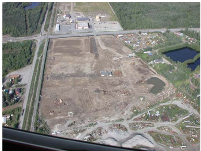
Today the Arctic Surplus Site is safe, clean, and ready for industrial redevelopment.

To make the site available for a wide variety of future activities, EPA approved a redesigned cap for the on-site hazardous waste containment area. Due to EPA's modifications, the property owner can now use this area for parking, storage, and other business needs.