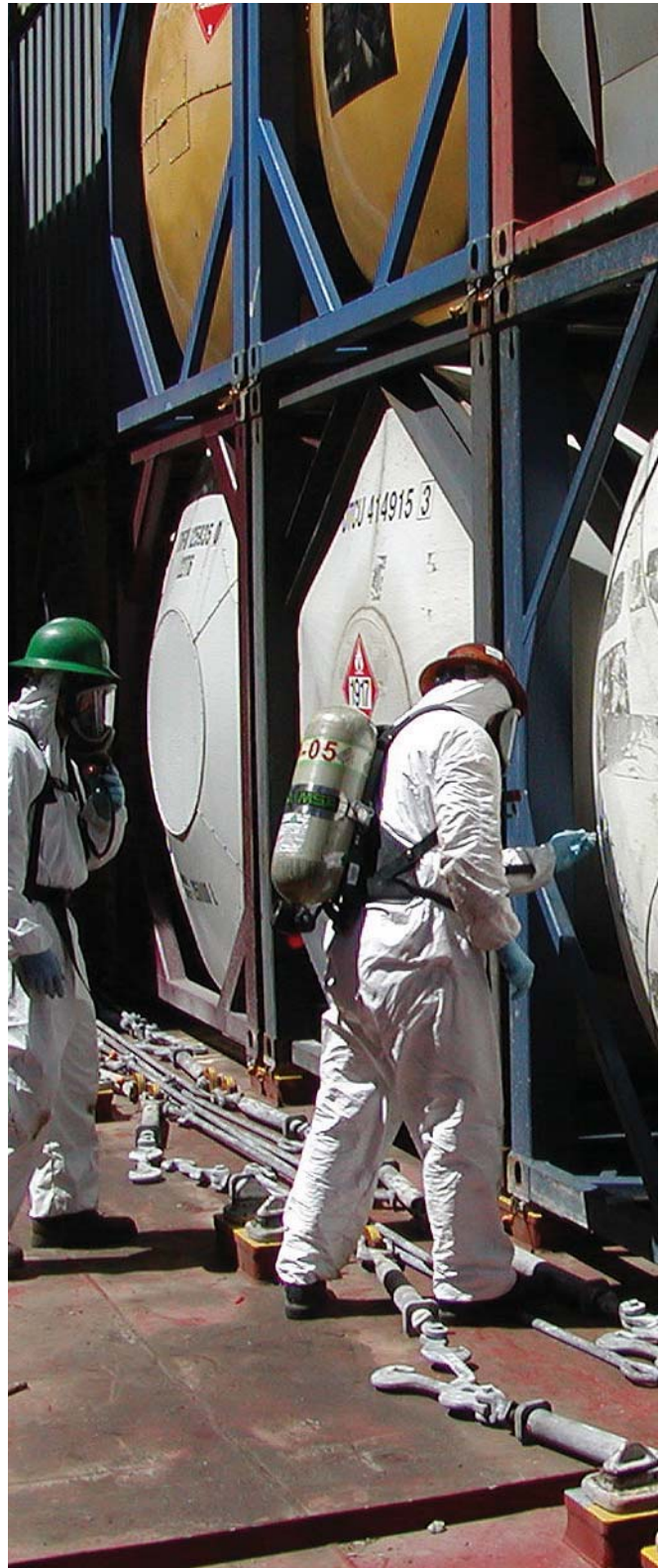
EPA monitors vapors on the Axel Maersk cargo ship to protect Port of Tacoma employees and the surrounding community.

When EPA staff arrived on board, they helped to find, isolate, and contain the source of the hazard. EPA also monitored the air to protect Port employees and the surrounding community. EPA and the Coast Guard determined that one of the containers on the ship released vapors due to high internal pressure. EPA helped move the container to a quarantined area on the dock for re-certification. Due to the fast response by all parties, the Axel Maersk was able to resume business and leave Tacoma three days after the incident.