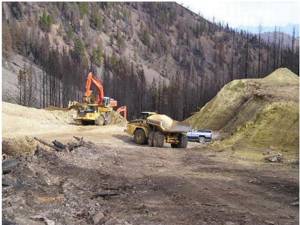
A fast cleanup at the Harmony Mine protects downstream waters from copper contamination.

In just two months, EPA and the U.S. Forest Service co-led a $500,000 cleanup to remove the tailings, place them in a secure repository, and cap them. The agencies built a 1.3 mile road so that large construction equipment could get to the site. They also reconstructed the stream channel to be stable and seeded disturbed areas.