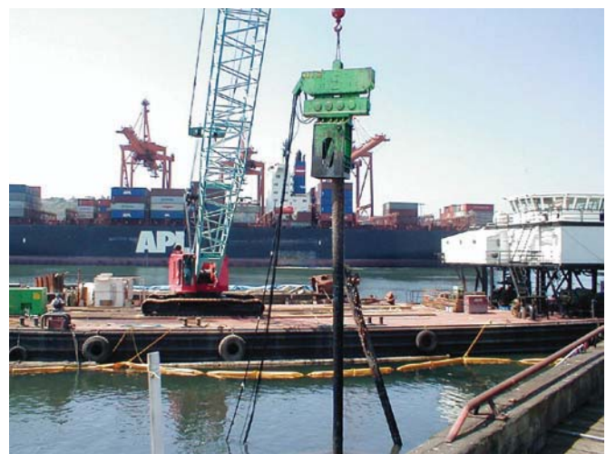
Cleanup at the Harbor Island Superfund site includes removing about 8,000 creosoted piles.

EPA signed two legal agreements this past year that make these major cleanups possible. Cleanup plans include removing four-plus acres of piers, removing about 8,000 creosoted piles, dredging more than 300,000 cubic yards of contaminated sediments, capping more than four acres of contaminated sediments, and improving habitat for salmon.