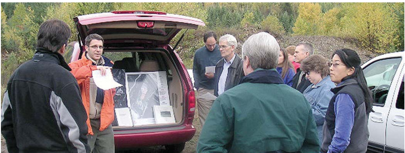
EPA employees discuss cleanup in the Coeur d’Alene Basin.

In non-populated areas of the Box, work is nearly complete. Revegetation efforts have been extremely effective. New plants and animals are flourishing in areas that have been devoid of life for decades.