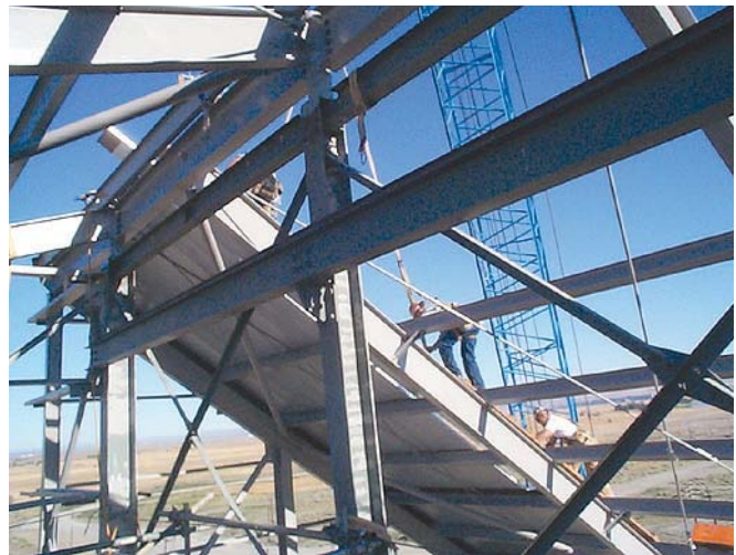
This year the Department of Energy cocooned a third nuclear reactor.

The Department of Energy finished cocooning a third nuclear reactor at the 586-square-mile Hanford Nuclear Reservation, which is the most contaminated nuclear waste site in the United States and the site of the world's largest environmental cleanup. Cocooning involves tearing the reactor down to the 3-foot concrete shield wall, and putting a safe, secure structure of galvanized steel on top of it.