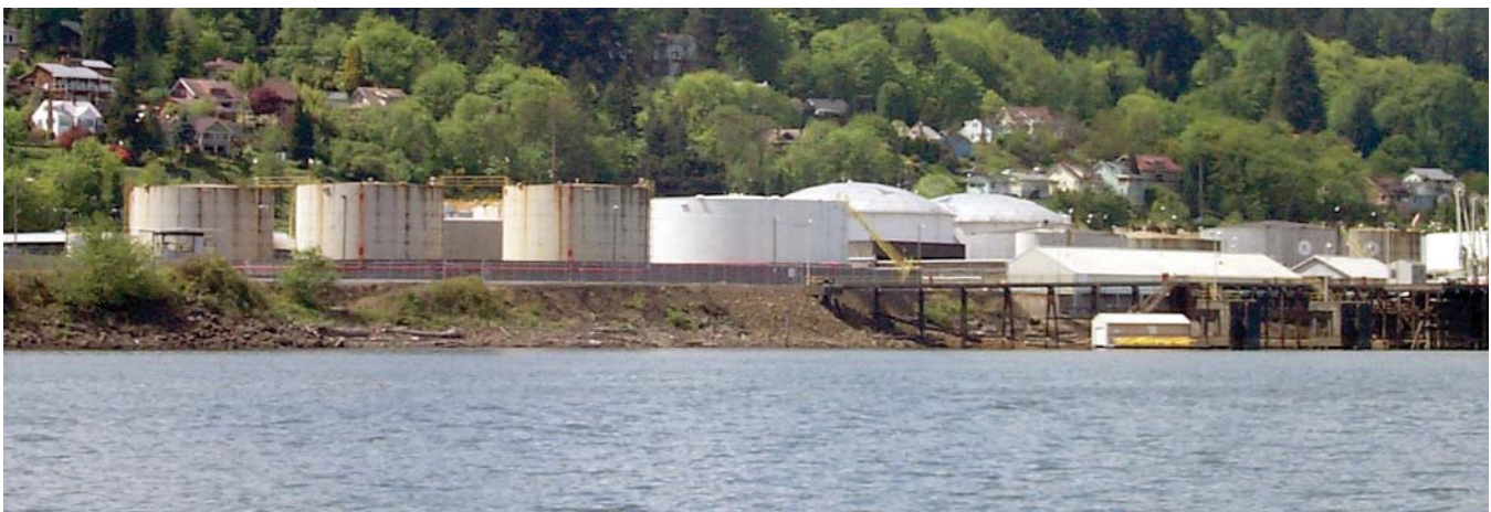
EPA will use fish tissue data to help determine sediment cleanup levels at Portland Harbor.

Progress at Portland Harbor stems from close teamwork on many fronts. EPA and the Oregon Department of Environmental Quality are cooperating with citizens, tribes, and public agencies to ensure that the investigation incorporates a wide range of concerns. Six tribes and several federal and state agencies work in partnership with EPA to resolve technical issues regarding work plans and collection of sediment samples.