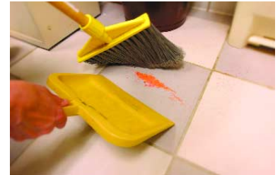
Clean up food spills completely.

If you're looking for a way to decrease your use of toxic chemicals in your home, take a look at how you handle unwanted pests. The best method to control pests, such as bugs and rodents, inside your home is to keep them out by cleaning up crumbs and spills quickly. Instead of reaching for a can of toxic spray, grab a broom!