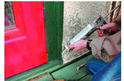
Caulk cracks and weather strip windows and doors to eliminate easy paths of entry. Check your foundation for cracks or spaces.