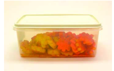
Store food in tightly sealed containers.