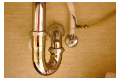
Plumbing leaks and damp basements can be an essential source of water for insects. Get rid of the moisture, and you could solve your bug problem.