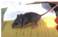
Figure 2: Radio-collared juvenile brush mouse.