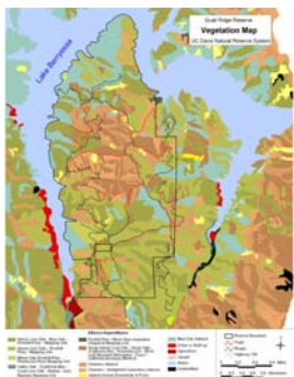
Figure 1: Habitat map of the Quail Ridge Reserve.

I am investigating the influence of natal habitat type on dispersal and habitat selection behavior of brush mice ( Peromyscus boylii ) in a naturally heterogeneous landscape at the University of California's Quail Ridge Reserve in Napa Co., CA (Figure 1). Brush mice (Figure 2) are a small, nocturnal rodent abundant in both chaparral and oak woodland habitat types.