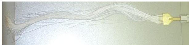
Figure 2. Image of a Hollow Fiber Microfiltration Membrane Bundle