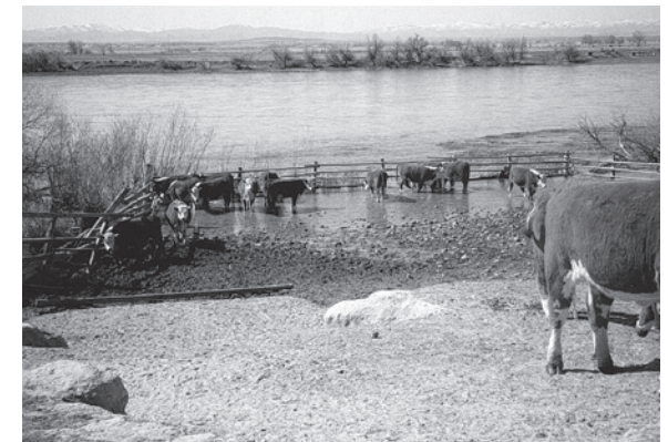
Cattle with Direct Access to a River.

Violations such as those pictured in this brochure could result in administrative penalties.