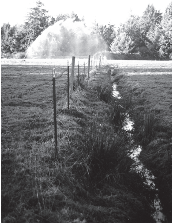
Application Directly into a Drainage Ditch