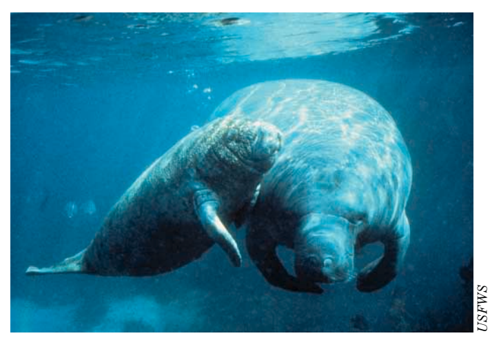
Merritt Island NWR is home to the largest population of Florida's east coast manatees.

The endangered west indian manatee frequent this spot at Haulover Canal year round but is most likely to be seen in the fall and spring. The observation deck is located on SR 3 on the northeast side of Haulover Canal, 10.5 miles from the Visitor Center.