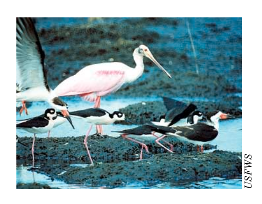
A common sight through binoculars at Merritt Island National Wildlife Refuge.

suggest the island was home to at least seven distinct Indian cultures beginning as early as 7,000 BC. Their burial mounds and shell middens remain today as a mute reminder of their past civilization. Spanish explorers, British colonists, pioneer citrus growers, and civil war troops all contributed to the history of Merritt Island.