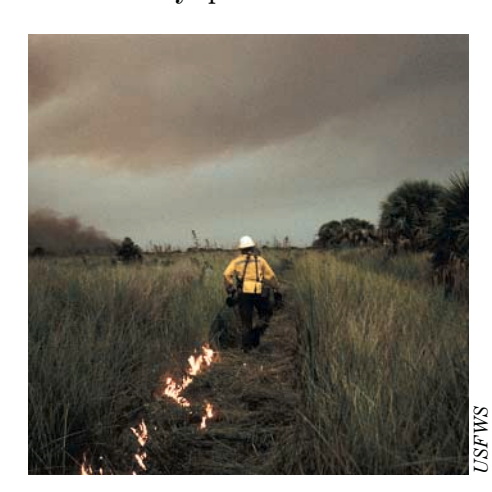
Torching a prescribed fire in a refuge marsh.

Fire and water are the two primary management tools used at the refuge. Historically, wildfires in Florida were a natural part of the ecosystem and occurred every 3-10 years. Prescribed burns have not replaced wildfires, but mimic wildfires for the many beneficial effects. Fire improves habitat and availability of food for many species like the Florida