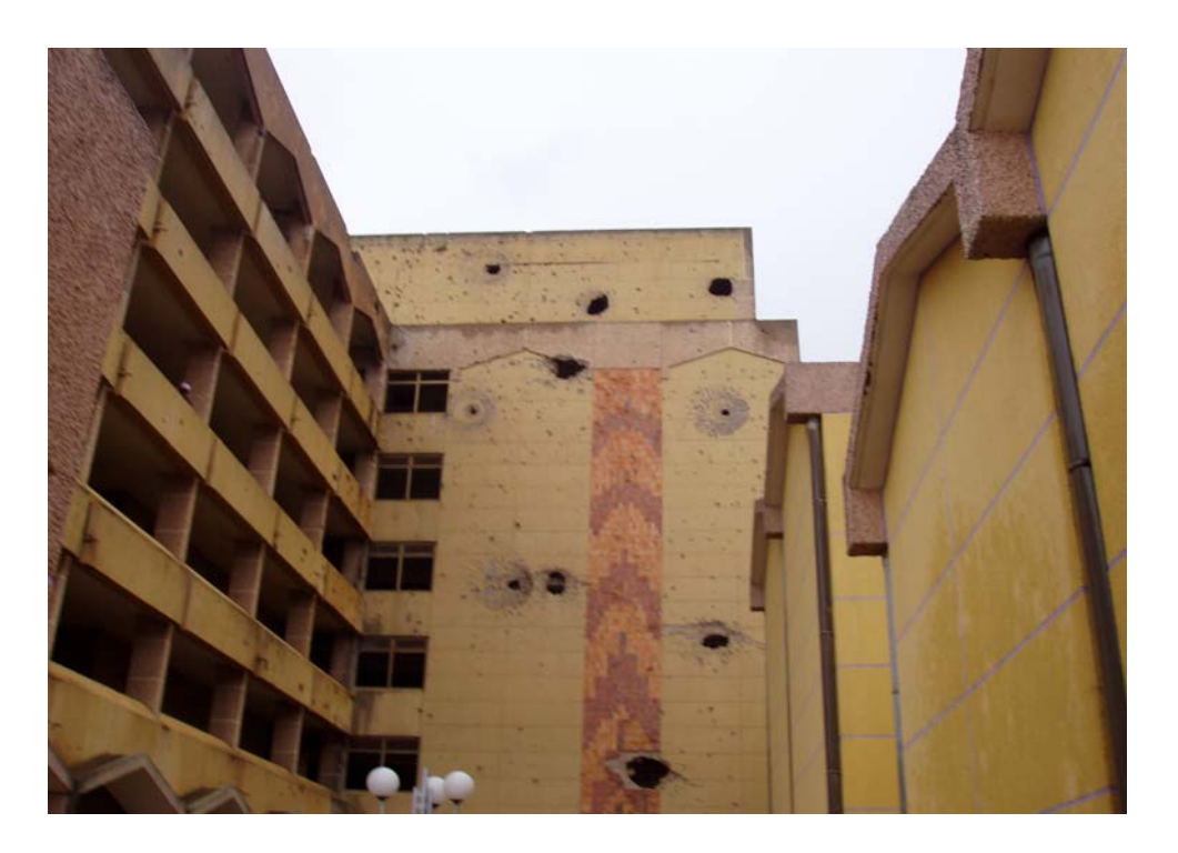
Damage from the 1994 war is still evident on Rwanda's parliament building.