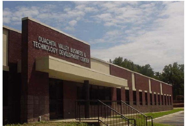
Newly Constructed Ouachita Business and Technology Redevelopment Center