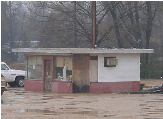
Former Adams Avenue Property

With the backing of federal entities such as the U.S. Environmental Protection Agency (EPA), the Economic Development Administration (EDA), and the U.S. Army Corps of Engineers (USACE), the Port of Camden, Arkansas is working to restore a blighted area of town along the Ouachita River.