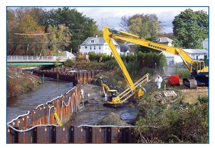
Removal – Excavation in the "Dry"

Dewatering/Water Treatment Dewatering and/or water treatment is often a necessary step in the handling of materials that are removed, particularly sediment, to facilitate treatment and/or disposal of the material.