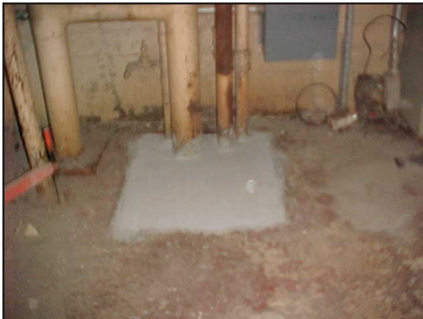
(21) Open pipe chase in former boiler room at northeast end of Building 51 was filled in with flowable fill and capped with concrete.