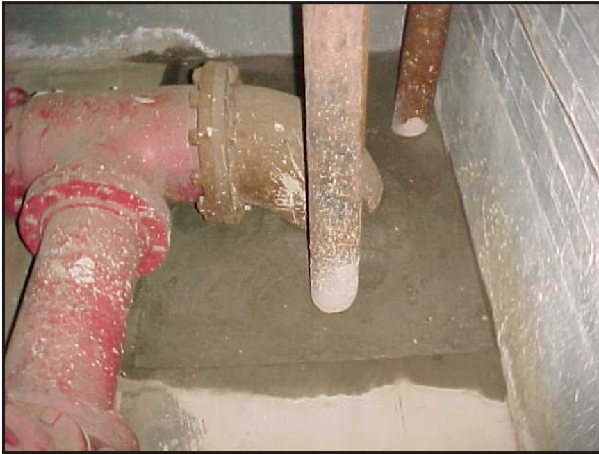
(24-1) Fire pump pit (location 1) located adjacent to compressor room at northeast end of Building 51 filled in with flowable fill and capped with concrete.