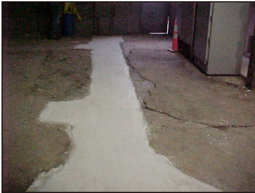
(19) Open gravel floor areas in former boiler room at northeast end of Building 51 have been sealed with concrete.