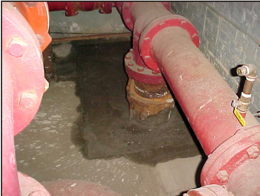
(24-2) Fire pump pit (location 2) located adjacent to compressor room at northeast end of Building 51 filled in with flowable fill and capped with concrete.

GENERAL ELECTRIC COMPANY PITTSFIELD, MASSACHUSETTS SECOND ADDENDUM TO SUPPLEMENTAL SOIL GAS MIGRATION ASSESSMENT REPORT AND SAMPLING PLAN