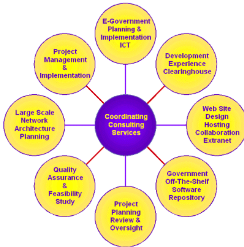
Coordinating Consulting Services & Technical Assistance Provided by IRM/CIS to USAID Missions

CIS, through a partnership with SETA Corporation, has available a team of experienced, highly qualified, certified network engineers, systems engineers, network architects, application developers, IT project managers, and IT strategists with international IT project development and implementation experience. This team of experts provides technical assistance to ensure that the project is being implemented on time, on track, and according to specifications. CIS also serves as a Cognizant Technical Officer (CTO) to Program Managers to assist them with rapid implementation of projects, oversight of complex projects, project audit and review, and other coordinating services.