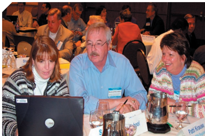
Workshop Subject Matter Experts Collaborate to Develop Message Maps.

Descriptions of the six individual scenarios, along with lists of potential questions and a set of message maps developed for each, are provided below. The summaries of the scenarios presented are intentionally brief and general in nature for security purposes. They are intended to provide the broad context under which the questions and maps were developed.