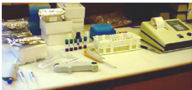
Figure 2-1. Beacon Analytical Systems, Inc. Atrazine Tube Kit

Since the same number of antibody binding sites are available in each tube and each tube receives the same number of atrazine-enzyme conjugate molecules, a low concentration of atrazine in a sample allows the antibody to bind many atrazine-enzyme conjugate molecules. The result is a dark blue solution. Conversely, a high concentration of atrazine allows fewer atrazine-enzyme conjugate molecules to be bound by the antibodies, resulting in a lighter blue solution.