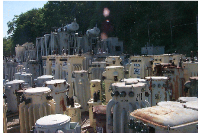
Figure 5-3. Transformer yard at ORNL.

The oil samples did not require homogenization. The samples, contained in 4-oz glass jars, were split into 10-mL aliquots using a disposable plastic syringe. The samples were randomized and labeled similar to the soil samples (described in Section 5.1.3). As mentioned previously, most of the native concentrations of total PCBs in the environmentally-contaminated oil samples were less than 50 ppm. Several of the transformer oils were augmented with additional Aroclors (up to ~200 ppm), so that a larger dynamic range could be tested. To spike the samples, approximately 250 mL of oil was poured into a 1-L wide-mouth jar. A stir bar was added, and the jar was placed on a magnetic stirrer. With the oil being stirred, hexane solutions of known concentrations of Aroclors were added to increase the total PCB concentration. A single Aroclor was added to specific transformer oils. The specific augmented concentration levels are described in Section 7.