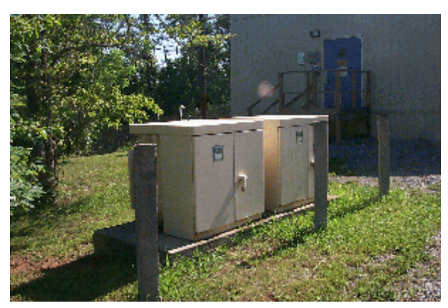
Figure 5-4. Transformers at ORNL containing oils with PCB concentrations greater than 50 ppm.