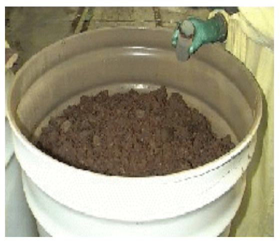
Figure 5-1. K-25 personnel collect a PCB sample from a 55-gallon drum.

Soil was collected from the top of the drum and placed in a plastic bag. The soil was then sifted by hand to remove rocks and other large debris, and placed in a plastic-lined 5-gallon container. Figure 6-2 shows the samplers performing this procedure. The amount of soil collected half-filled the 5-gallon container, amounting to approximately 12 kg of soil. Once the sifting was completed, the plastic liner was then removed from the container. To homogenize the soil sample, the liner was rolled on the ground in a back and forth motion, such the sample was kneaded and thoroughly mixed. Two 40-mL amber vials were fill with the homogenized soil for preliminary analytical characterization. A third sample was taken for total radiological activity screening. Paducah soil