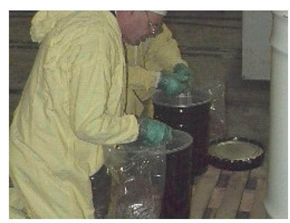
Figure 5-2. K-25 sampling personnel sift through the collected soil to remove rocks and other large debris.

The two analytical samples taken of each field-homogenized soils were analyzed by ORNL-based Grand Junction, Colorado (ORNL-GJ) field team who performed a preliminary on-site analyses of the PCB-contaminated soils. In Appendix B is presented ORNL-GJ's analytical procedures. ORNL's Chemical and Analytical Sciences Division (CASD) also performed preliminary characterization of the PCB-contaminated soils using a similar procedure. The total PCB concentration was measured in each analytical sample to determine which samples would be used in the verification. Results from the total activity screening indicated that the soils were not considered radioactive.