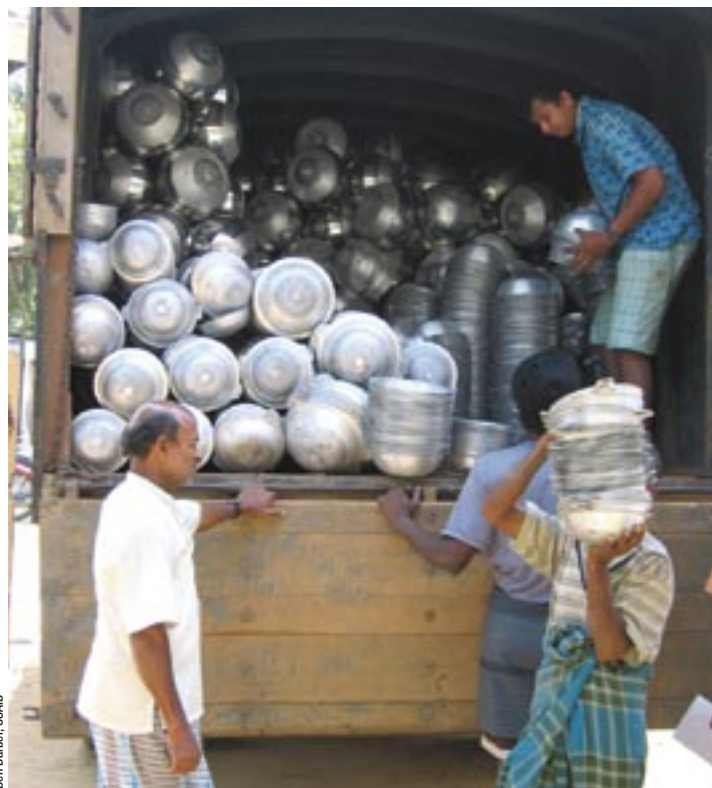
Sri Lankan workers deliver cooking pots, with support from USAID's Office of Transition Initiatives.

A: Having those offices out there really helped to inform things and to support the initial response. ★