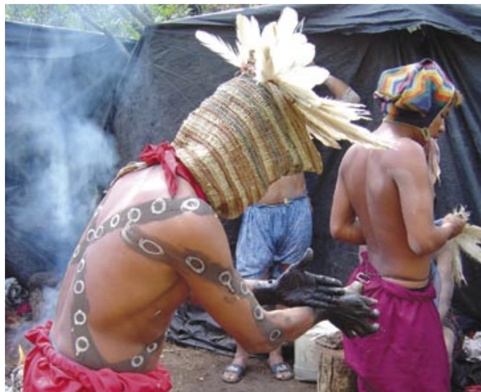
A group of indigenous men on the Chaco Biosphere Reserve prepare to perform a traditional dance.

support for research, monitoring, education, and information exchange related to local, national, and global issues of conservation and development. ★