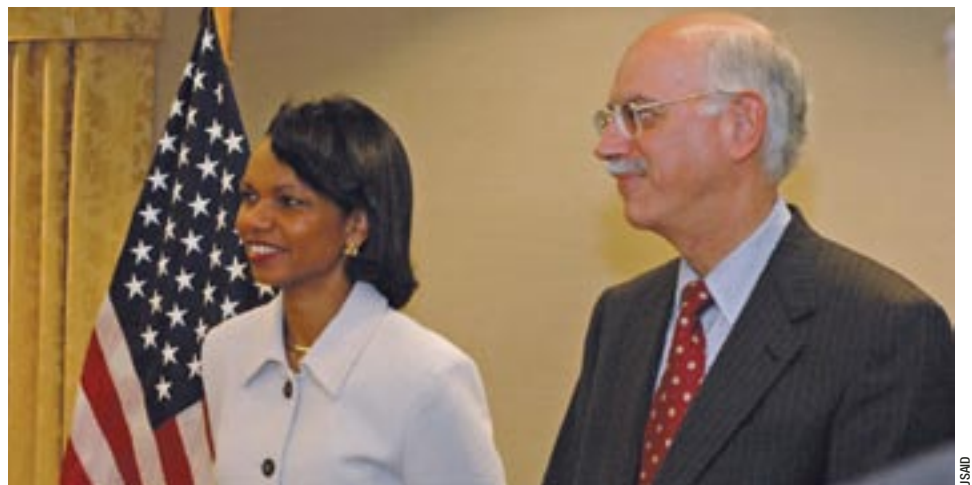
Administrator Andrew S. Natsios and Secretary of State Condoleezza Rice at USAID headquarters in Washington, D.C. Natsios announced he would leave on Jan. 12, 2006, after leading the Agency for five years.

"The United States government respects enormously the mission of AID and the way that they have discharged it," Rice added, citing tasks "that we had not had