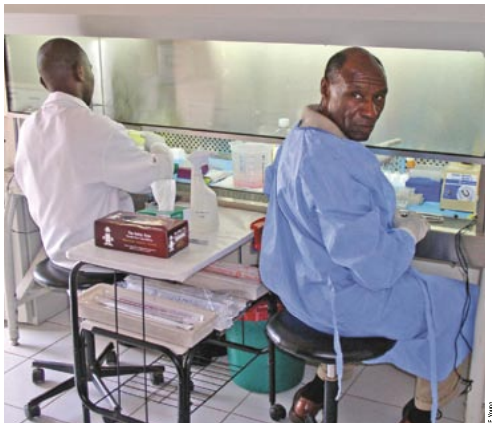
USAID supports numerous HIV/AIDS projects in Uganda, including testing and counseling clinics.

FOR MORE DETAILS ON THE AGENCY’S AWARD WINNERS, SEE PAGES 14–15