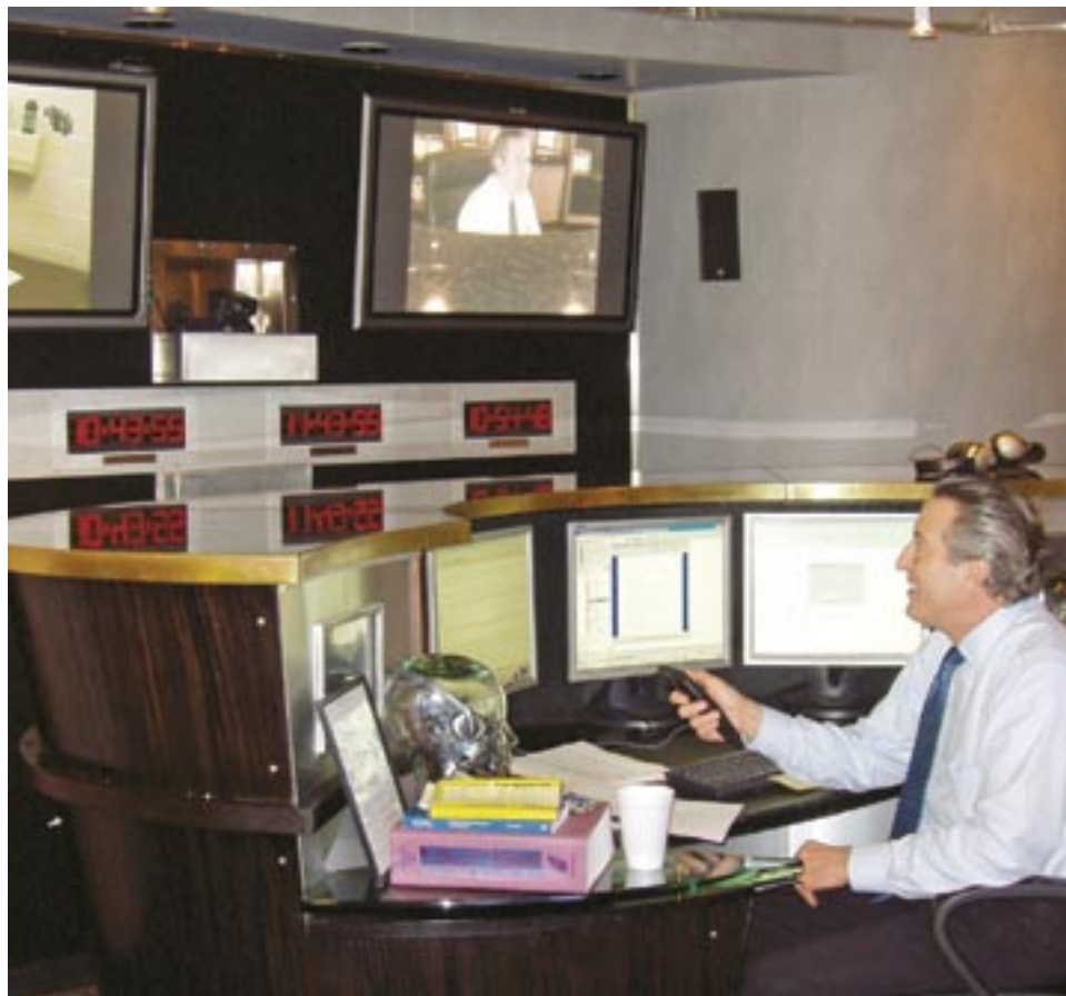
A doctor donating his time through the Medical Missions for Children telemedicine network is patched in through a live feed to a hospital in Latin America.