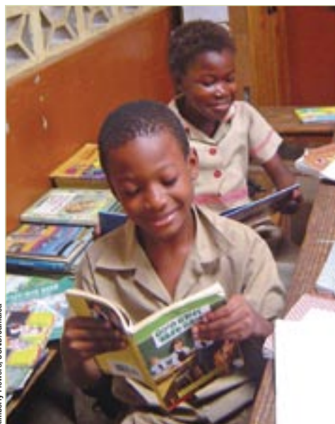
A boy and a girl read at Salt Marsh Primary School, just outside of Montego Bay. New books and reading audio-help materials have been provided to the school through a presidential-educational initiative, which has helped improve reading skills at this school and numerous others.

St. Margaret's operates in three shifts and adjusts its schedule on Fridays to accommodate some students who must stay home and help their parents work the farm or sell at the market that day. ★