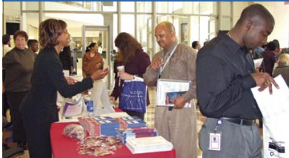
Agency employees attended a health fair Nov. 16 in USAID's 14th Street lobby to learn about their options for health benefits from major plan providers like Kaiser Permanente and Blue Cross/Blue Shield. USAID's medical unit also offered free blood pressure checks during the event. For information about health options, go to www.opm.gov/insure/health .

The early warning systems were implemented by the government of Vietnam, in collaboration with the U.N. Development Program.