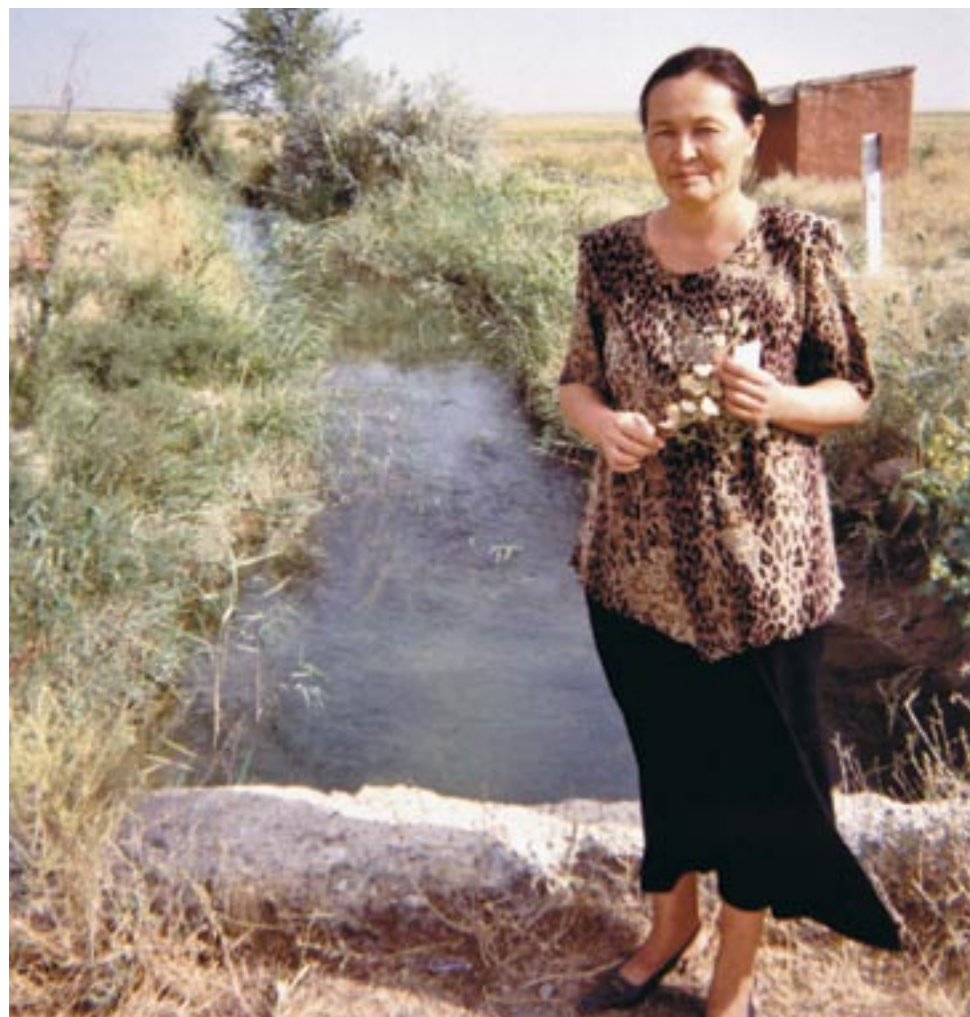
Yassy woman stands in front of new irrigation canal built with USAID funding.

ACDI/VOCA, CAIP's implementer in Kazakhstan and Kyrgyzstan, is a nonprofit organization that promotes broad-based economic growth and the development of civil society by working on community development, business development, financial services, and agribusiness systems. ★