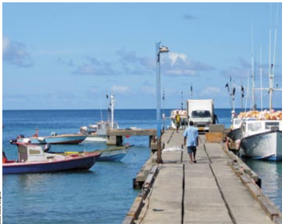
Fishermen in Grenada are starting to go back out to sea, as they have received help from USAID to repair their boats after Hurricane Ivan. Hundreds of fishermen lost equipment and their boat engines were damaged.

Grenada Agency for Reconstruction and Development