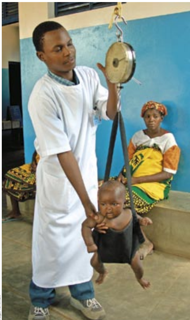
A baby is being weighed at the Mossuril Health Center. It is one of 11 health centers in Mozambique where staffers were challenged to improve services without receiving additional funding or other resources.

Mossuril still needs money for a new kitchen and medical equipment. But, Sampo says: “This program has been a process of gaining self-confidence for all of the staff here, and together we are going to move forward to work over our next obstacles.” ★