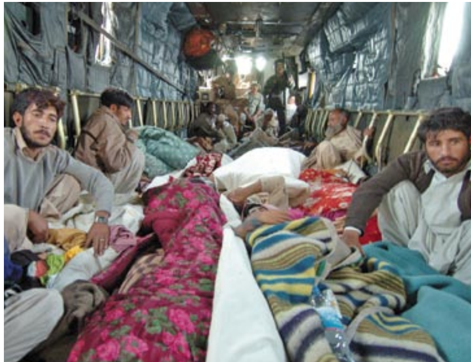
Injured Pakistanis are transported to Chaklala, Pakistan, for medical help Oct. 14 aboard a U.S. Navy MH-53E Sea Dragon helicopter.