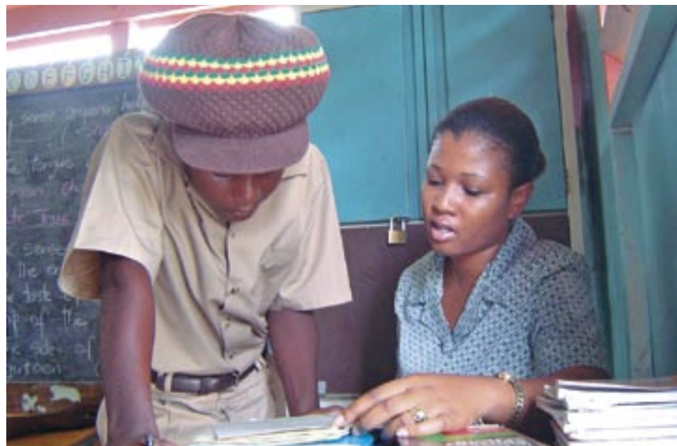
A teacher works with a remedial student at the St. Margaret's Human Resource Center in Kingston. The after-school activity is part of a program aiming to improve education of at-risk youth. In Jamaica, 26 percent of males are illiterate and some 142,000 youths are out of school and unemployed.