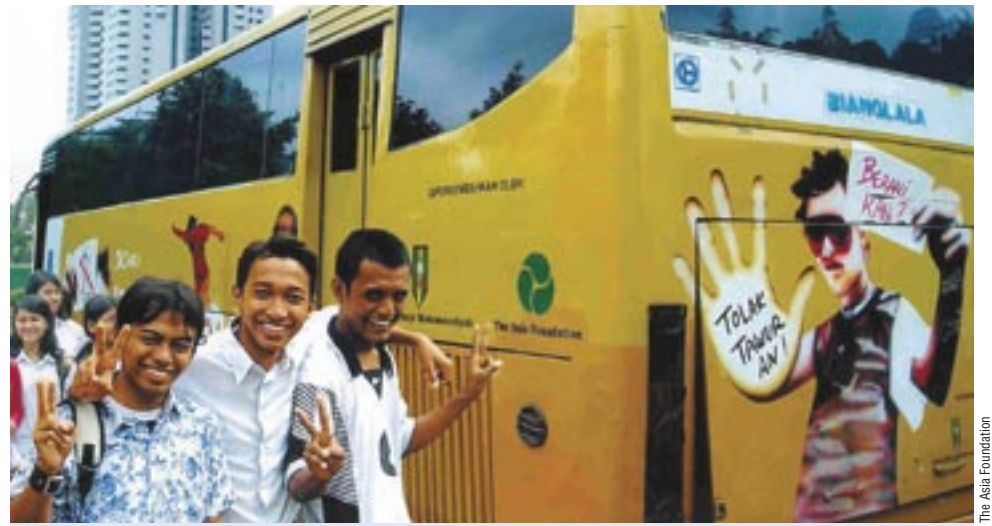
Bus advertisements promote tolerance and active nonviolence to teenage youth in Indonesia.