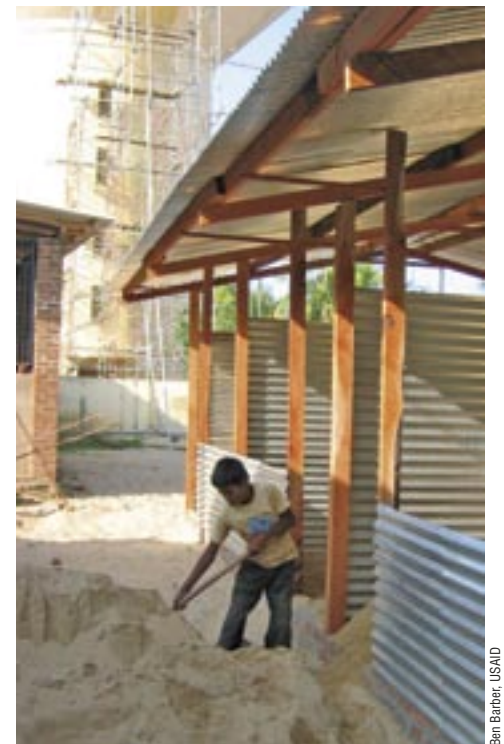
A boy works on a temporary housing project for Sri Lankans displaced by the tsunami.