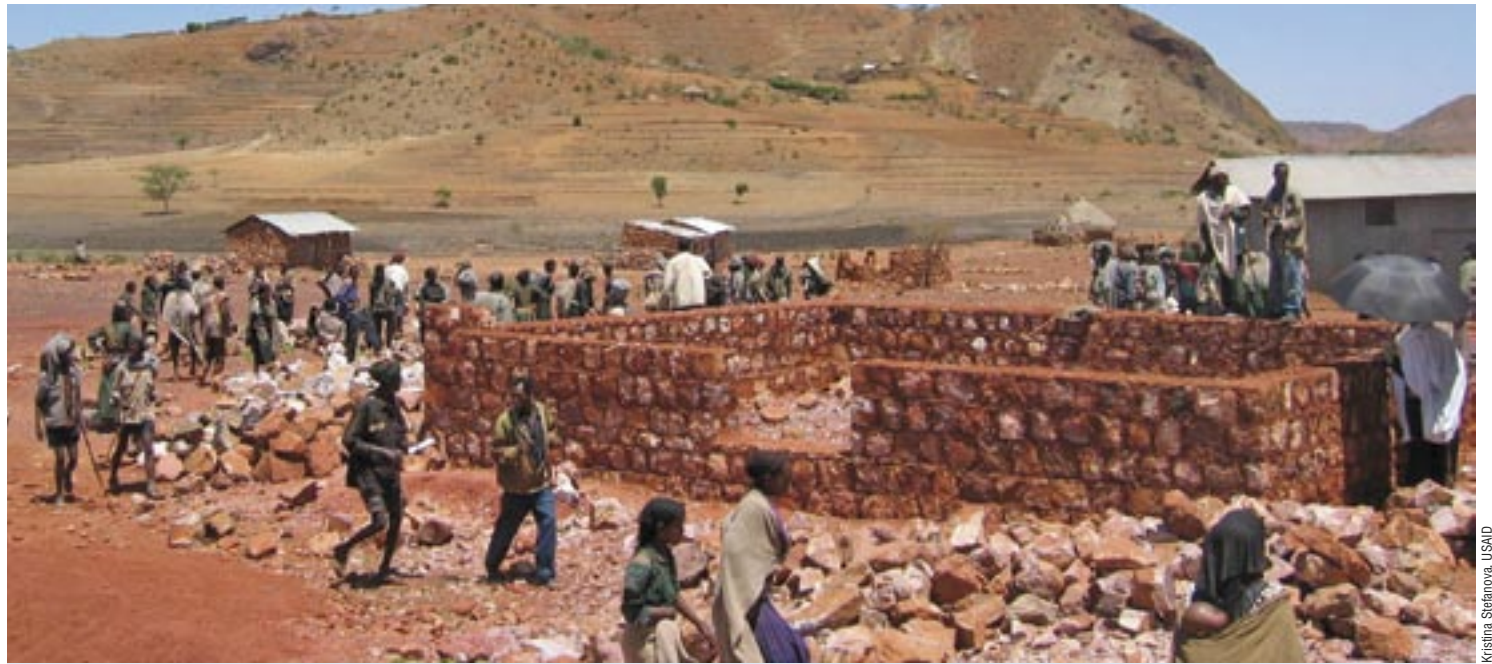
Farmers in a village near Sekota build a grain bank. The Ethiopian government’s Productive Safety Nets program, which USAID supports, is assisting farmers to build better storage for their grains, diversify their earnings by producing milk and cheese, and keep bees.

are seeing positive changes. They have constructed some 115 kilometers of feeder roads, making the district more accessible. Last year, thousands of fruit tree seedlings were produced and planted. Two grain banks were built, in which 291 farmers store sorghum, wheat, barley, and beans to avoid postharvest loss and conserve for use during lean periods. Six farmers’ field schools were set up, where villagers learn about crop diversification and pest, soil, and moisture management.