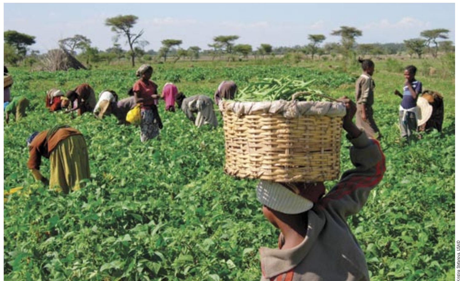
Women and children pick green beans at the Dodicha Vegetable Cooperative. The beans will be sold to a local exporter, who will sell them to supermarkets in Europe. A USAID project has helped link the small farmers to overseas exporters.

Last year the cooperative began supplying green beans to Ethioflora, earning a signifi-