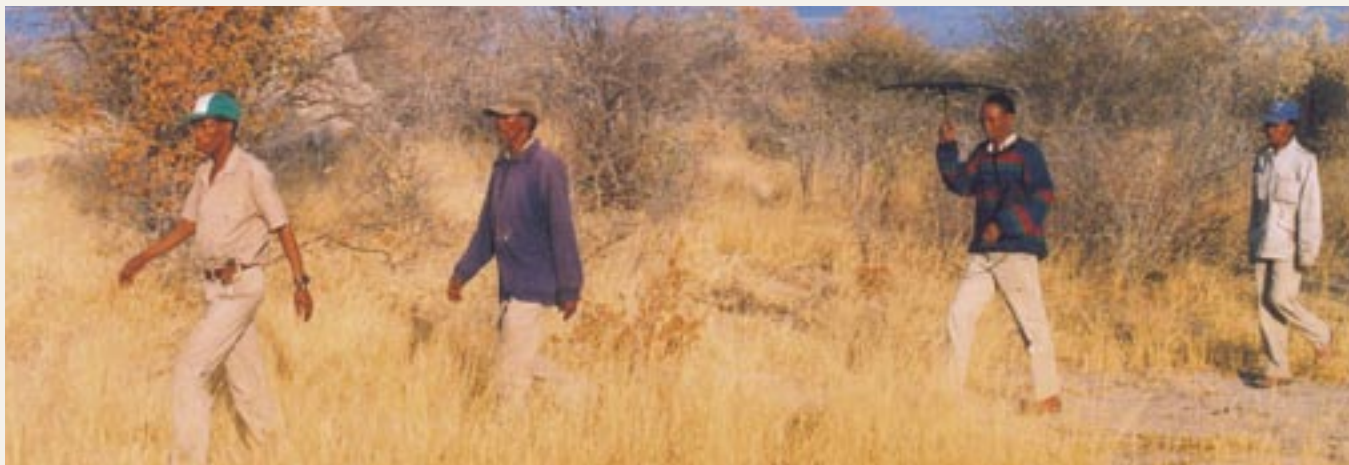
Game guards on the job at Nyae Nyae Conservancy. The third man is holding a global positioning system, used to count and track wildlife.

"It also touches upon biodiversity and conservation. People won't conserve or sustainably use natural resources unless they can see the benefit of conservation. And, of course, there's the livelihoods aspect. There, people may have absolutely no other source of income or very few other alternative sources of income. So this is a very tangible poverty alleviation program." ★