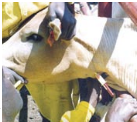
Blood sample being taken from an animal for a serological test.

Safety concerns about using vaccinia virus delayed field testing until a similar vaccine for rabies was distributed without incident over a million square miles in Europe and the United States.