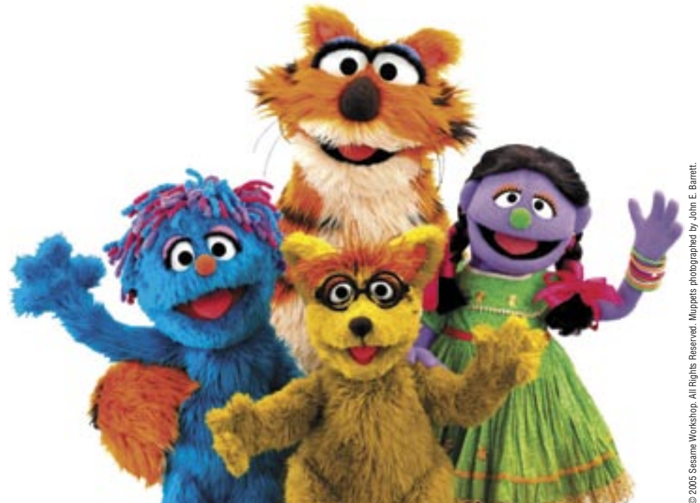
Clockwise from top: Halum, Tuktuki, Shiku, and Ikri-Mikri are featured in Sisimpur , the Bangladeshi version of Sesame Street that began airing in the country in April.

lions of Bangladeshi children have been counting along with them. As in other countries, the furry inhabitants of Sisimpur sneak education into their merrymaking. ★