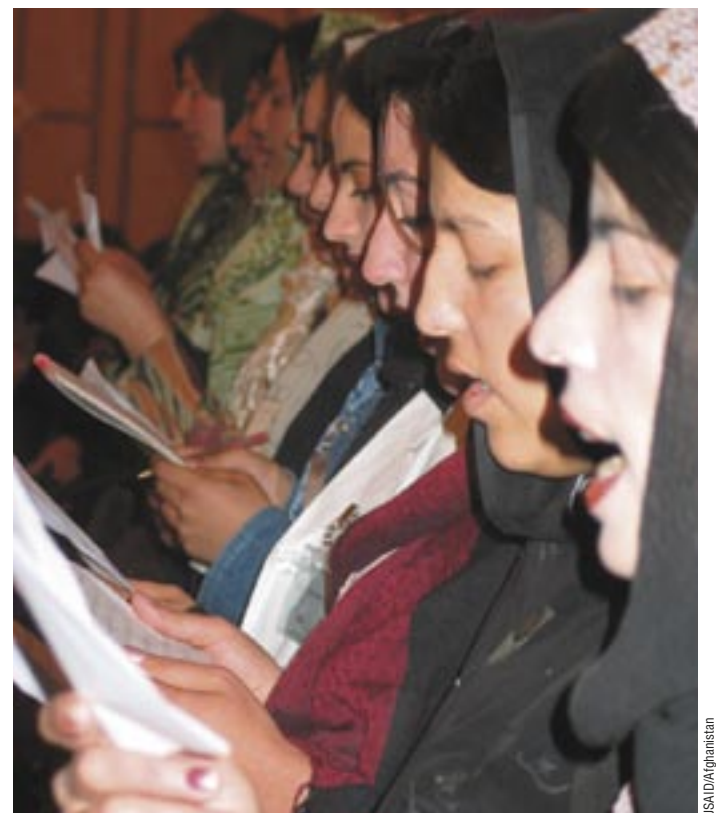
Women read their pledges as they complete a professional midwife training program.

Rick Marshall contributed to this article.