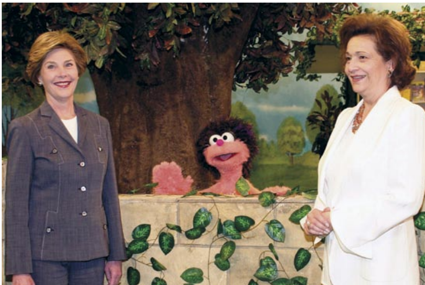
Laura Bush, left, and Egypt's first lady Suzanne Mubarak stand by the muppet Khokha while touring the set of Alam Simsim, or Sesame World, the Egyptian version of the popular American children's show Sesame Street. Bush was in Cairo May 23 as part of a tour of the Middle East. See an article on page 11 on the Bangladeshi version of Sesame Street.

GHAZNI CITY, Afghanistan —A radio program aired over a U.S.-assisted radio station warned residents to flee after a dam collapsed March 29, saving many lives from the resulting flood.