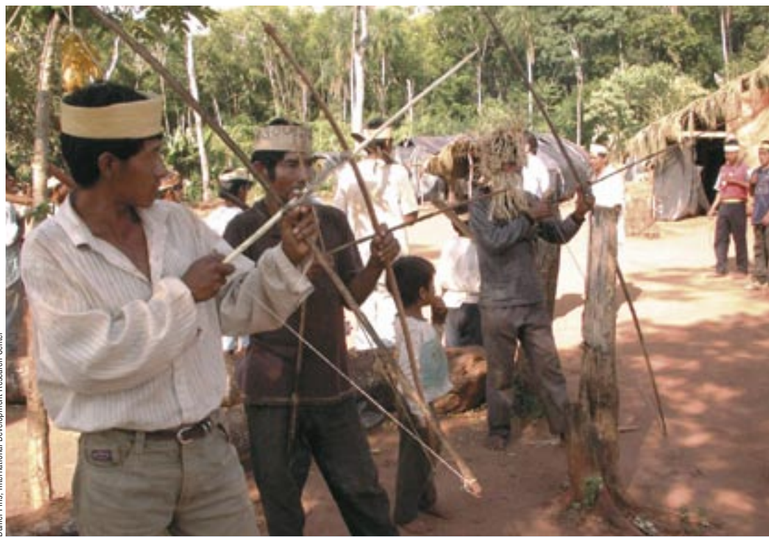
Mbya Guarani men symbolically defend their ancestral lands with rustic bows and arrows. In reality, their fight is being carried out within the legal system through land titling negotiations.

About 2 percent of Paraguay's population is indigenous, from some 17 different ethnic groups. ★