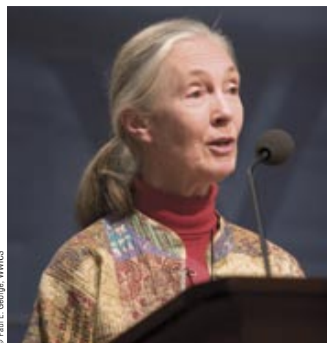
Primatologist Jane Goodall spoke about actions that are helping deplete Africa's wildlife at the April 11 Director's Forum at the Woodrow Wilson International Center for Scholars in Washington. Education, she said, is the first step toward "helping the people to understand that as the environment is destroyed, so their own life becomes increasingly hard and difficult."

"Every individual matters," she said. "And every day you live, you make an impact on the world around you." ★