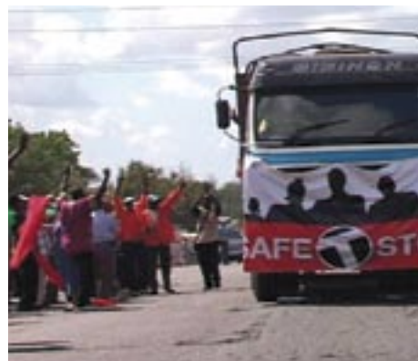
A convoy that departed from the Kokotoni Medical Clinic, a short distance from Mariakani, arrives at the SafeTStop launch event March 9.