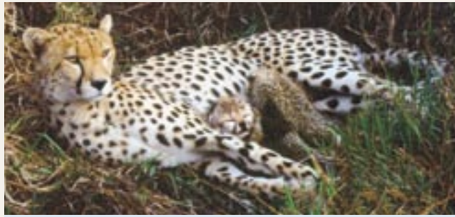
Namibia is home to the world's largest population of cheetahs—about 2,500. Their numbers have been increasing with the help of conservancies.

The registered conservancies protect some 20 million acres