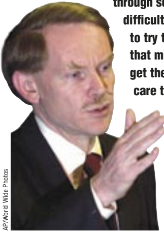
DEPUTY SECRETARY OF STATE ROBERT ZOELICK Khartoum, Sudan, April 14.

through some very difficult circumstances to try to make sure that millions of people get the food, basic care that they need..."