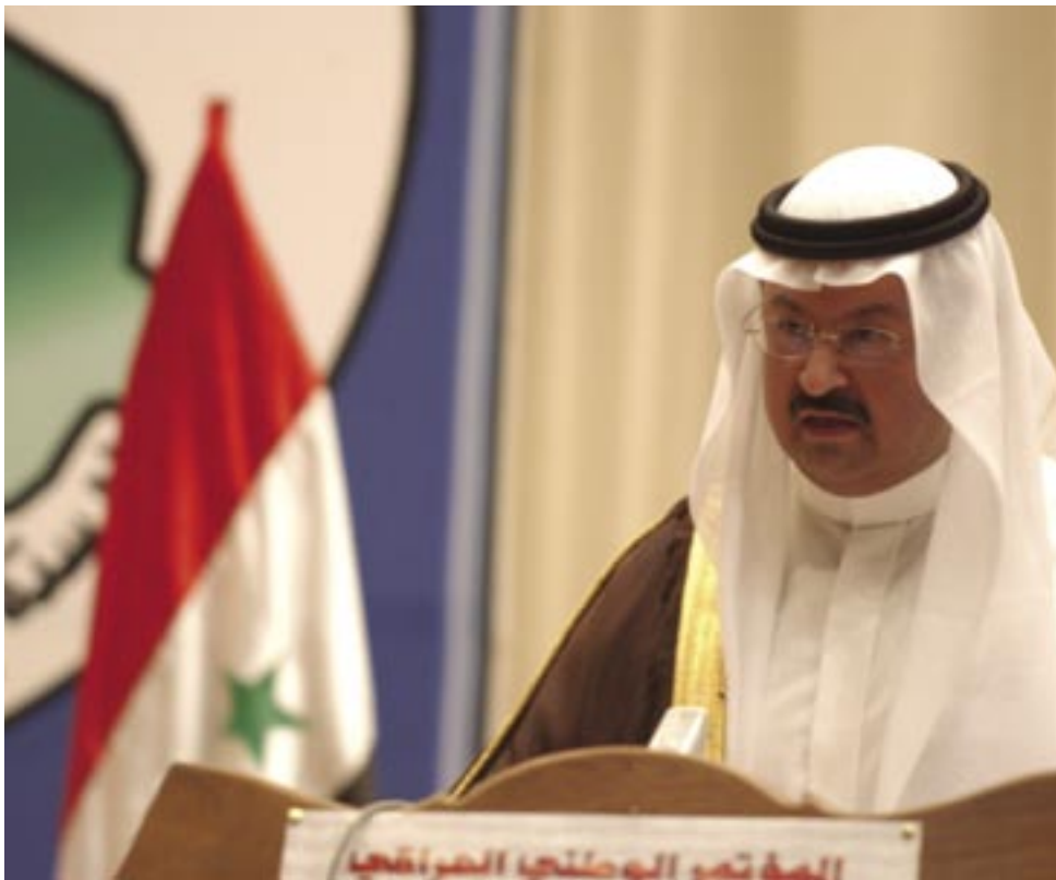
Iraq's President, Sheik Ghazi al-Yawar, speaks to delegates at the Iraqi National Conference in Baghdad, Iraq, August 15, 2004.

While Iraqi officials and political factions selected the 100 members of an interim national council, the USAID mission in Baghdad awarded new grants worth as much as $213 million to aid the new legislature and executive with constitutional drafting, elections, and civic education.