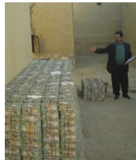
Afghan official shows off newly minted Afghanis, the reissued Afghan currency.

■ fiscal reform—assisting the Afghan government to move toward financial independence through reforms to its tax