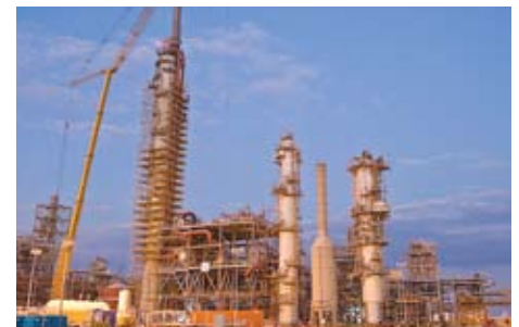
More than $275 million in U.S. exports have been used in the construction of an ammonia production plant in Ain Sokhna, Egypt.

The plant is expected to be in operation in late 2008 and will produce 2,000 metric tons of ammonia per day. Based on the plant's progress, EBIC has taken preliminary steps toward replicating the project on a larger scale, which may lead to additional U.S. exports in the future.