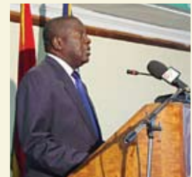
Ghanaian Vice President Mahama addressed participants at the opening of USTDA's West Africa ICT Roadmap to Opportunities conference.

Information and communications technology (ICT) infrastructure is a catalyst for growth and development around the world. To focus attention on this critical sector in West Africa, USTDA co-sponsored the West Africa ICT Road Map to Opportunities conference with the U.S. Department of State and the Government of Ghana in July.