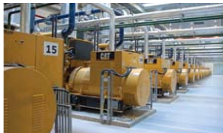
Caterpillar engines/generators were used in the construction of the Jincheng coal mine methane power facility in China.

The project was designed to further Chinese efforts to reduce greenhouse gas emissions, improve mine safety and increase the capacity of the local power grid. USTDA supported the project with a grant to Shanxi Jincheng Anthracite Coal Mining Group (JMG), which funded a contract between JMG and SCS Engineers, Inc.