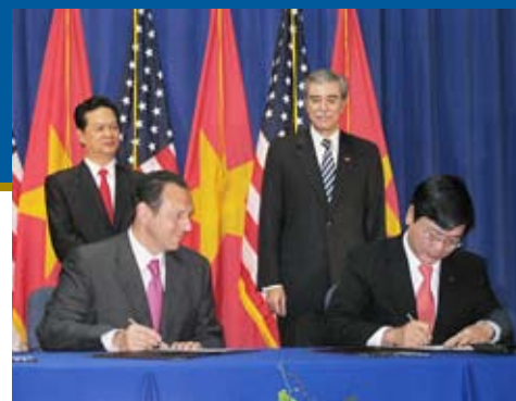
Vietnamese Prime Minister Dung (standing left) and U.S. Commerce Secretary Carlos M. Gutierrez (standing right) look on as an agreement between Sabre and Vietnam Airlines is signed through which Vietnam Airlines will implement an Internet booking engine and e-commerce system using Sabre's technology solution. The project was furthered by USTDA-funded technical assistance.

At the event, Vietnam Airlines committed to implement an Internet booking engine and e-commerce system from Sabre, Inc. of Southlake, Texas. This success was made possible by a USTDA-funded technical assistance program conducted by Unisys Corporation. The final recommendation outlined necessary system upgrades and procedures for Vietnam Airlines to comply with the International Air Transport Association's Simplifying the Business program, a global e-commerce initiative for the airline industry.