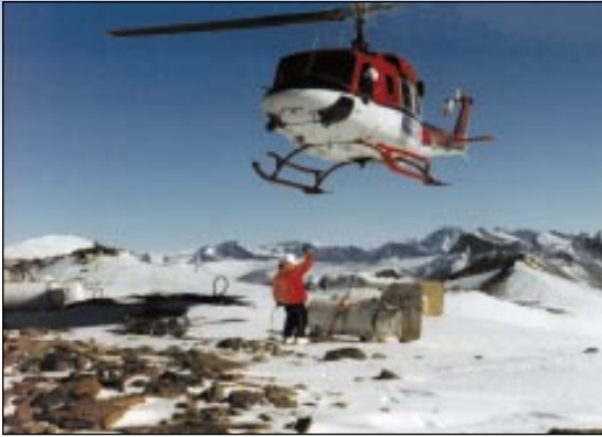
GSN stations are designed for optimum performance in a wide variety of environments. This station near Mt. Newall in Antarctica was installed and operated for the U.S. Air Force by the USGS. The helicopter is delivering propane that will fuel generators that power the station. Data from this station are transmitted to Scott Base, Antarctica; thence worldwide via the Internet.

states of California, Oregon, Washington, Alaska, and Hawaii.