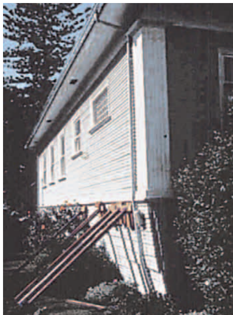
This home in Santa Cruz, California, damaged in the 1989 Loma Prieta earthquake, shows the effects of a weak "cripple-wall" connection between the upper part of the house and its foundation. Houses without adequate connections to foundations can easily shift during even moderate earthquake shaking, causing extensive damage. For example, pipes and wires may be broken by a slight cripple-wall shift, resulting in fires, water damage, or other problems. Much damage of this type can be avoided by using inexpensive bracing techniques, such as those recommended in the seismic design provisions of building codes.

For more information contact: Earthquake Information Hotline (650) 329-4085 U.S. Geological Survey, Mail Stop 977 345 Middlefield Road, Menlo Park, CA 94025 http://quake.wr.usgs.gov