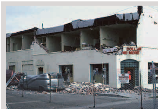
The upper wall of this unreinforced masonry building in Fillmore, California, collapsed and destroyed a parked vehicle during the 1994 Northridge earthquake. Unreinforced masonry buildings are especially susceptible to collapse or severe damage during strong earthquake shaking. Shaking-hazard maps can be used to determine if such buildings in a particular area need to be reinforced to make them safe in earthquakes.

A new series of national shaking-hazard maps was prepared by the USGS in 1996. Each of these maps shows the severity of expected earthquake shaking for a particular level of probability. For example, the map at the top of this page shows levels of earthquake shaking that have a 1-in-10 chance of being exceeded in a 50-year period. This new series of maps also depicts shaking using a number of different measures that engineers can readily apply to designing earthquake-resistant buildings of different heights.