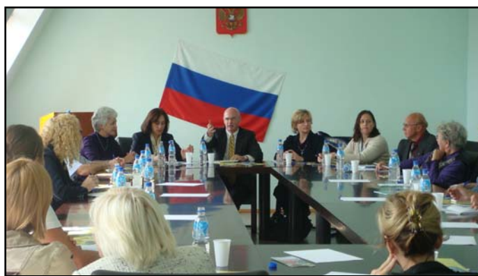
USAID/Russia staff learn about the issue of human trafficking in the Russian Far East; NGO roundtable, Vladivostok, September 2007

USAID/Russia's programs have primarily focused on