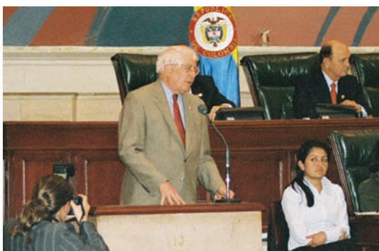
Rep. David Price (D-N.C.), chairman of the House Democracy Assistance Commission, addresses a session of the Colombian Congress.

The commission provides technical expertise to enhance accountability, transparency, independence, and government oversight in the legislatures of these countries. For example, in Macedonia, Kenya, and Haiti, U.S. members of Congress and their staffs acted as trainers in Agency legislative programs.