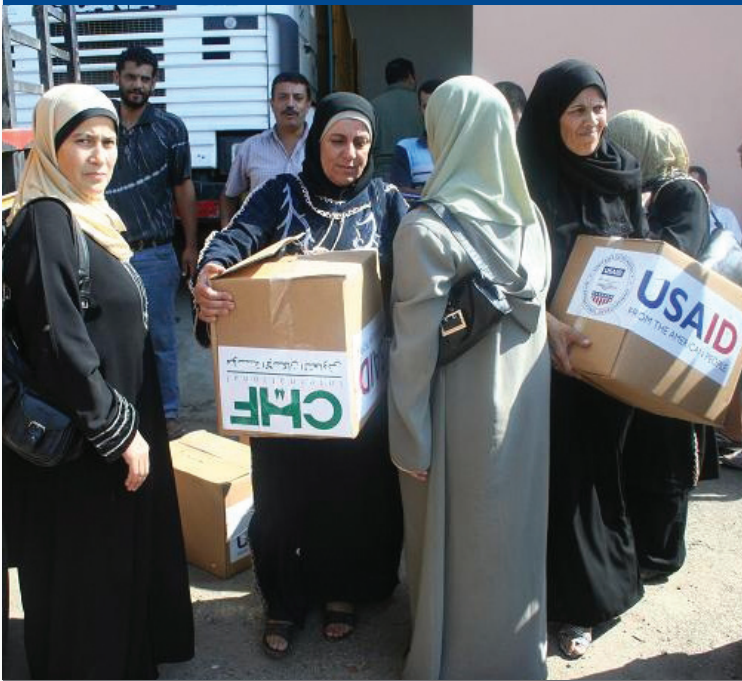
Women from a local community in Lebanon receive food baskets.

Safety was a serious issue for the families and the Agency.