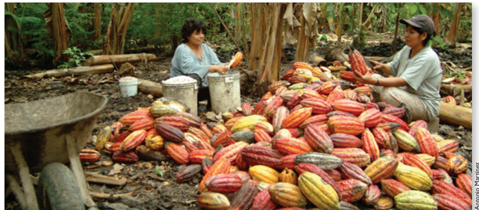
In the depths of the island of Pongo in Chazuta, a remote jungle area in the San Martín region in northeastern Peru, two former cocalero women cut open cacao pods for the sun-drying process to prepare the beans for organic chocolate production.

The Agency also has specific programs aimed at schools and health programs, prioritized by regions that have eradicated their coca. And a democracy program contributes to the program by working with local governments in the coca-growing areas. Resources are used for training and technical assistance to strengthen regional and municipal governments, improve staff, and expand responsibility and accountability. ★