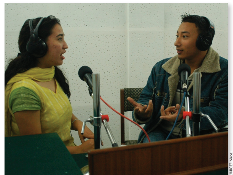
"Chatting with My Best Friend" is being recognized beyond its radio audience of Nepalese youth: the weekly program recently won the 2007 Global Junior Challenge Award, and was featured on CNN.

The national broadcaster, Radio Nepal, airs the program every Saturday, and it is rebroadcast by more than two