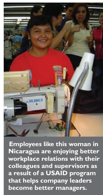
Employees like this woman in Nicaragua are enjoying better workplace relations with their colleagues and supervisors as a result of a USAID program that helps company leaders become better managers.

managers and workers to identify and resolve gaps in compliance issues such as forced overtime, improper health and safety practices, communication, and maternity leave. In so doing, factories aim to become compliant with their respective national legislation and the International Labor Organization's Core Labor Standards, and to increase worker morale and productivity.