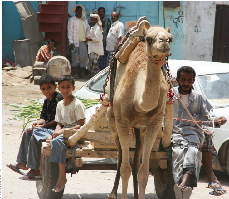
The city council in Jaar, in Abyan Governorate along the south coast of Yemen, has been working with U.S. support to tackle budgets, sewers, education and other issues traditionally handled by the central government. This camel cart was delivering materials to a fish market built by the council with U.S. support. See pages 8-9 for other USAID projects in Yemen.

In addition, in the last year, record food prices have sparked unrest in Guinea, Indonesia, Mauritania, Mexico, Morocco, Senegal, Uzbekistan, and Yemen. ★