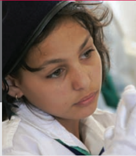
A girl attends a school in southern Lebanon that received computers, desks, and kitchen equipment from USAID.

See page 3 to learn how food was distributed to a Lebanese conflict zone.