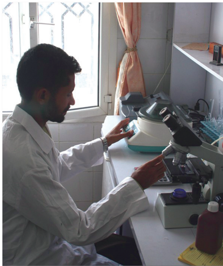
A technician works with medical equipment provided by USAID to a district hospital in Yemen's Marib Governorate.