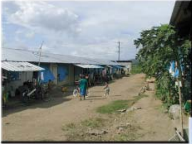
Figure 5: Temporary Shelters and Permanent Housing at El Pataste, Honduras