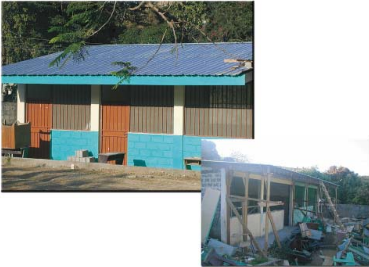
Figure 4: School Under Repair in Honduras