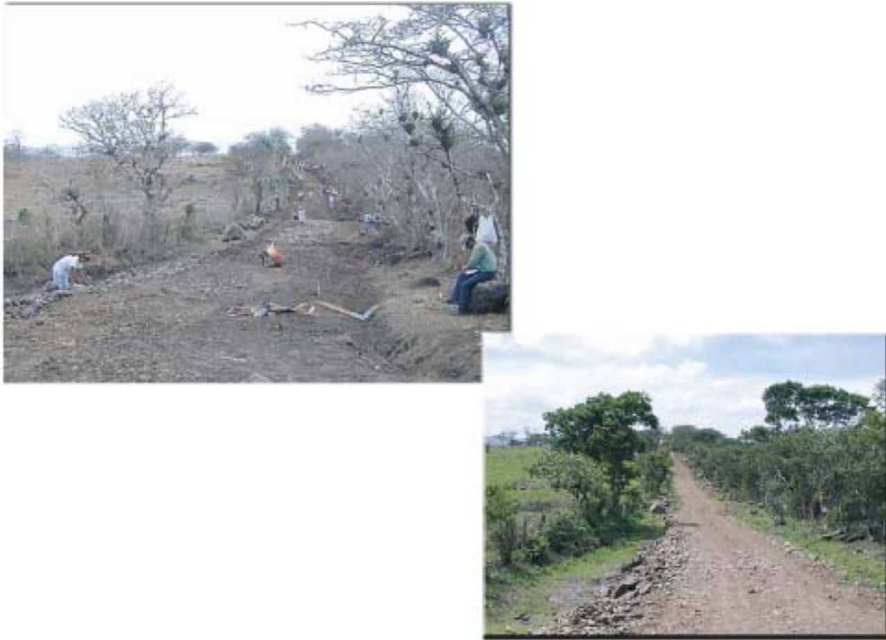
Figure 6: Rural Road Near Jinotega, Nicaragua