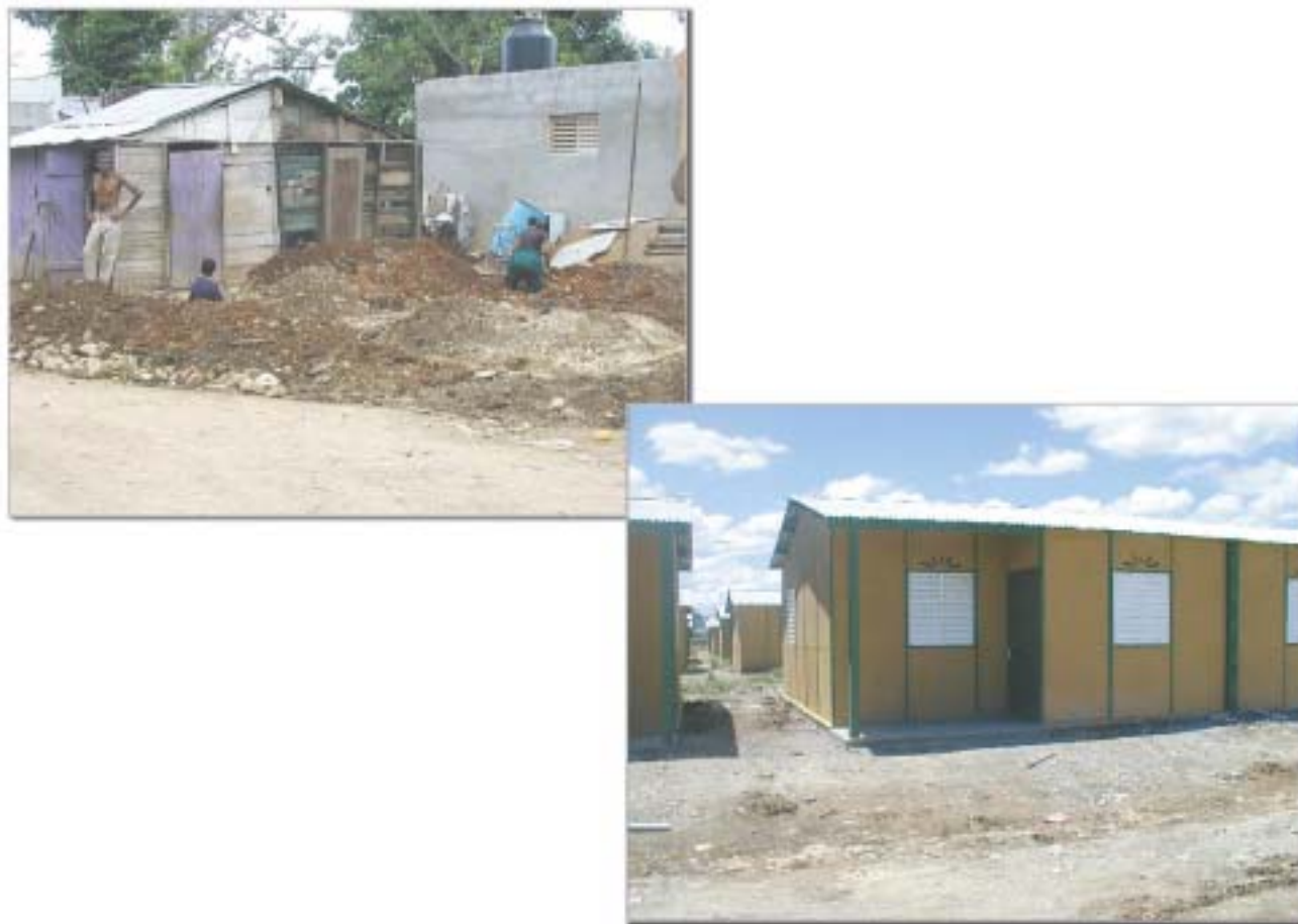
Figure 2: Damaged and Permanent Housing in the Dominican Republic

other U.S. agencies ranged from installing stream gauges for early flood warning to equipping national public health laboratories. These and many other projects resulted in improved transportation, agricultural land restored to productive use, improved health through potable water and sanitation systems, increased access to health care and education, increased employment through credit programs, and improved capabilities to mitigate the effects of future disasters.