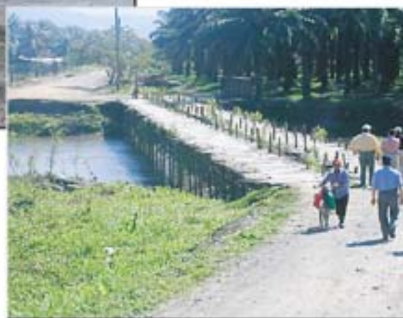
Temporary bridge erected after hurricane