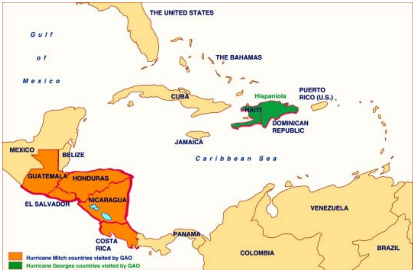
Figure 1: Map of Central America and the Caribbean Showing the Hurricane-Affected Countries Visited by GAO