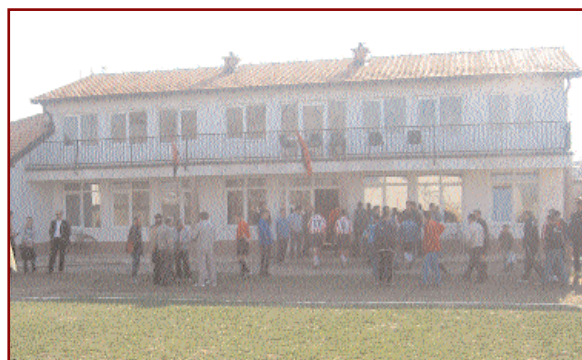
(inset photo: new dressing facility)