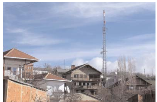
KTTN has plans to construct more towers such as this in order to increase broadcast coverage across Kosovo.

"The implementation of this fee will force us to improve our programming even more," says Zatriqi enthusiastically about the station's new programming. "We are transmitting in five languages and have multi-ethnic staff working together not only under the same roof, but in the same room." This is extremely important, he believes, as Kosovo seeks to support a diverse society. ☞