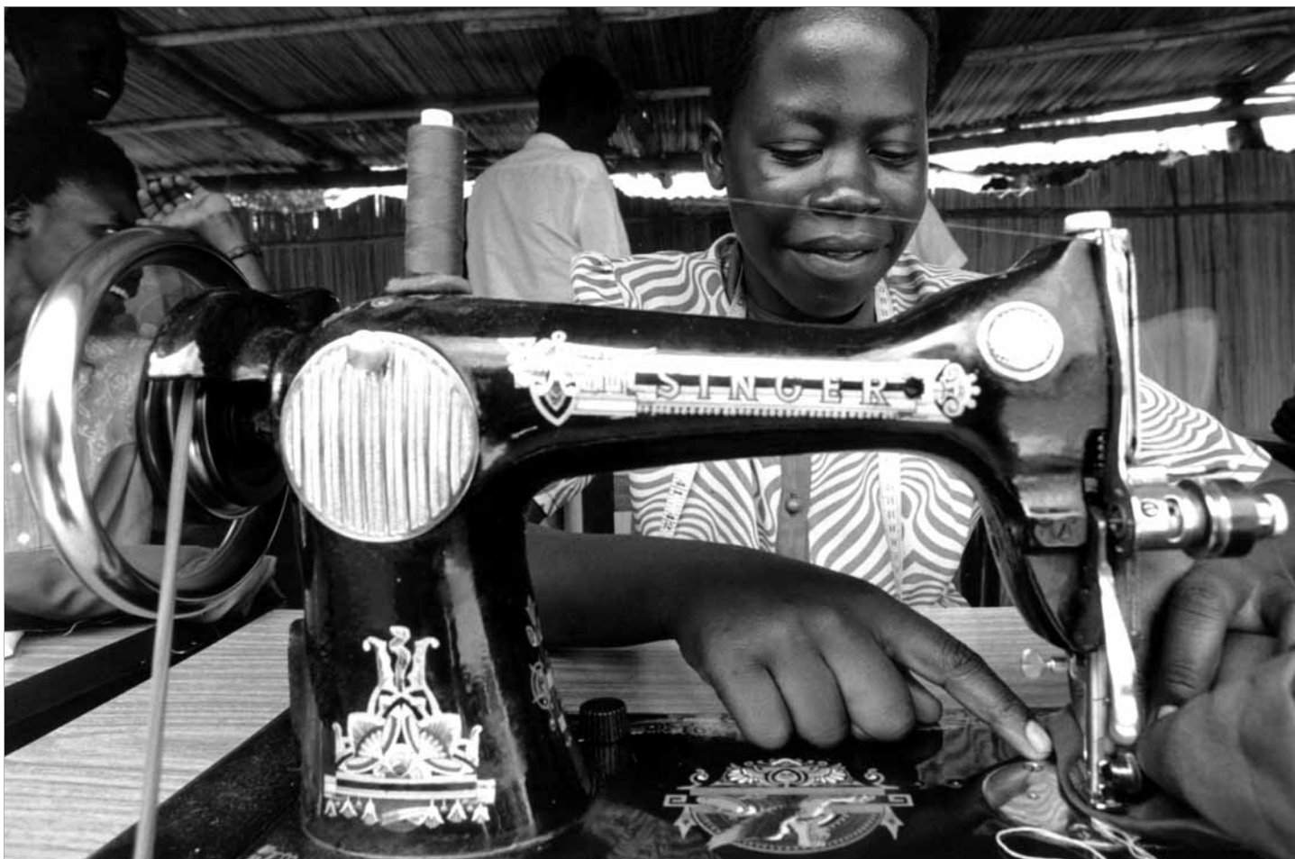
A girl works at a sewing machine, part of a skills training workshop in Uganda.

depend on women since many were not able to resume income-generating activities either because they suffered from disabilities or because institutions that had employed them had collapsed during the war (Gardner and El Bushra 2004). Women's central involvement in livelihood protection makes them key participants in both assisted and unassisted recovery strategies. Appropriate assistance can be targeted for women to help maximize the effectiveness of their livelihood strategies and create employment opportunities for men so that they are able to contribute to the welfare of the household.