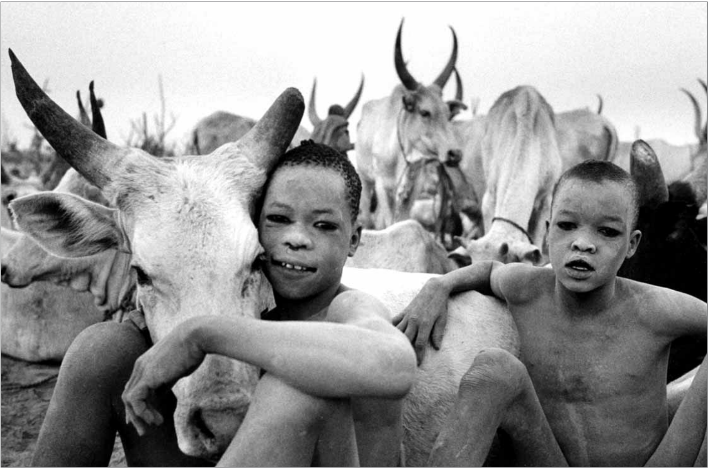
Dinka boys with their cattle.

standard of living as the host community without depleting the (often scarce) resources of the hosts. This may require a "cross-mandate" approach where similar assistance is offered to groups who might not be included in an agency's traditional focus. The community-based assistance approach was tried with considerable success in Central America during the 1980s, and during the early 1990s in Cambodia and Ethiopia.