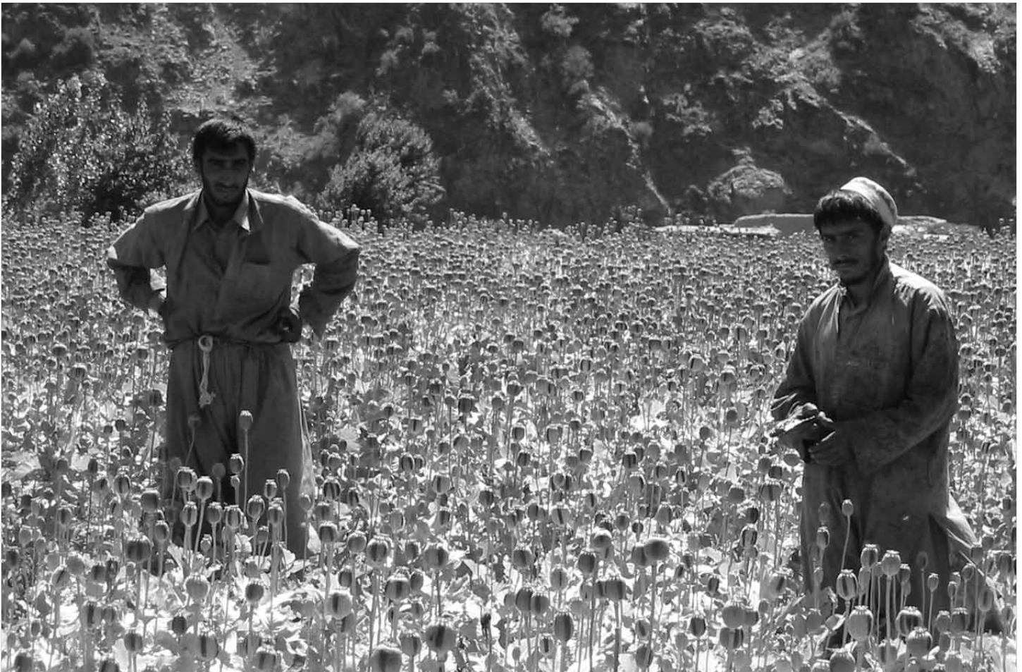
Opium poppy fields in Afghanistan.

Relief assistance will rarely be the only type of intervention needed.