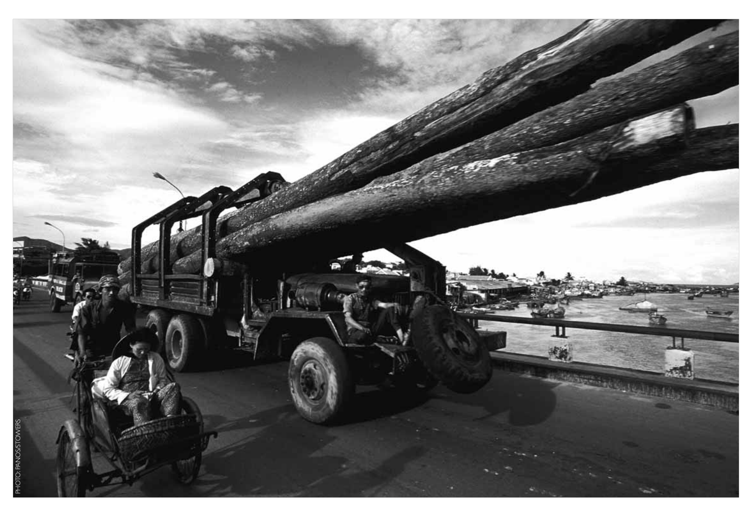
Logging truck on its way to a sawmill in Nha Trang, in central Vietnam.

Large-scale commercial logging by outside private companies often has considerable adverse sociopolitical and environmental impacts on local forest users and forest-dwelling communities.