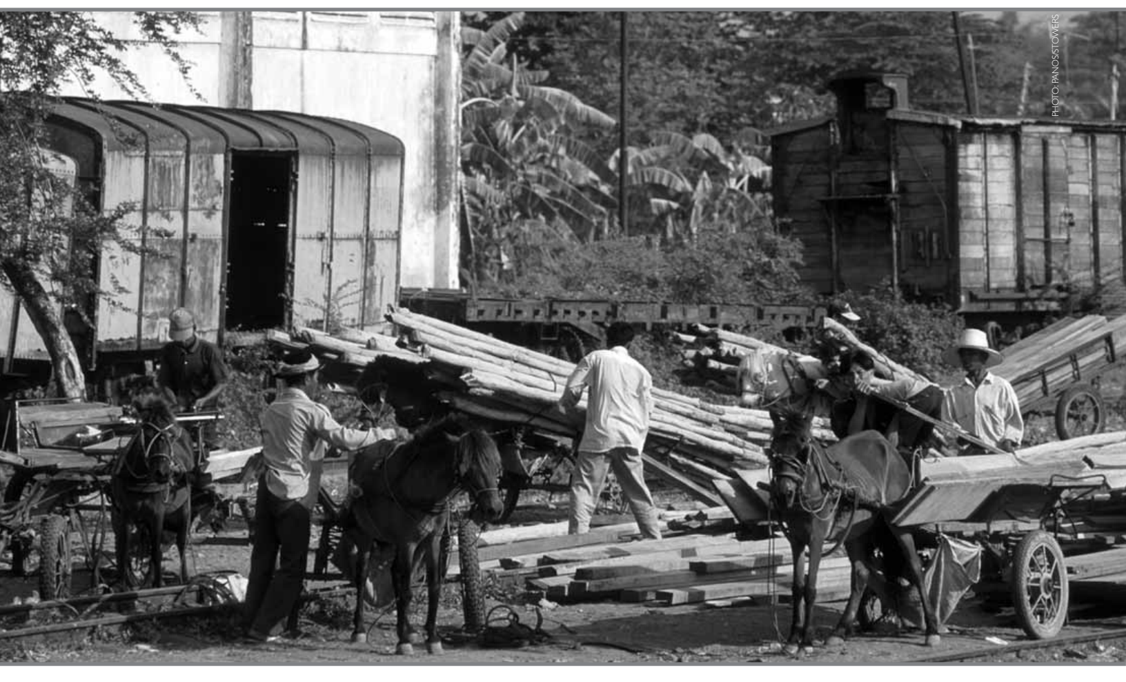
Loading timber at a railway station in Cambodia.

This section lists key questions that evaluate the risk of conflict linked to the exploitation of timber. They should help development agencies effectively integrate forest management and conflict prevention tools into their programs and projects. Not all questions will be relevant to each case or region due to natural, historical, and cultural differences.