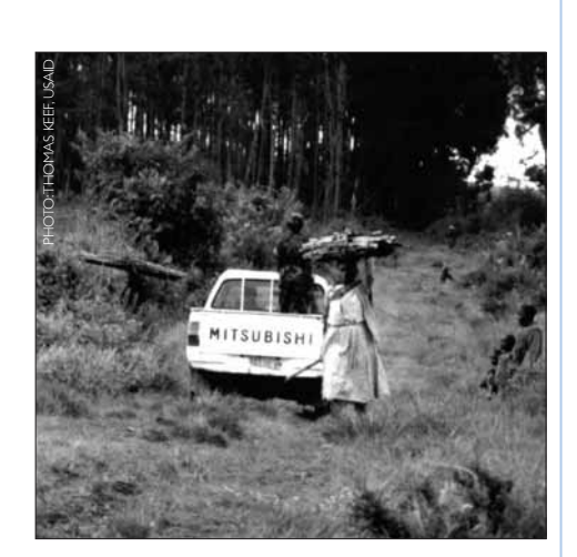
Rwanda's remaining natural forests are under pressure from an expanding population.

management on a global scale thereby promoting sustainable and responsible forest practices in countries in Asia, Africa, and Latin America. Partners in this Alliance include World Wildlife Fund. Metafore and retailers such as Home Depot and Anderson Corporation.