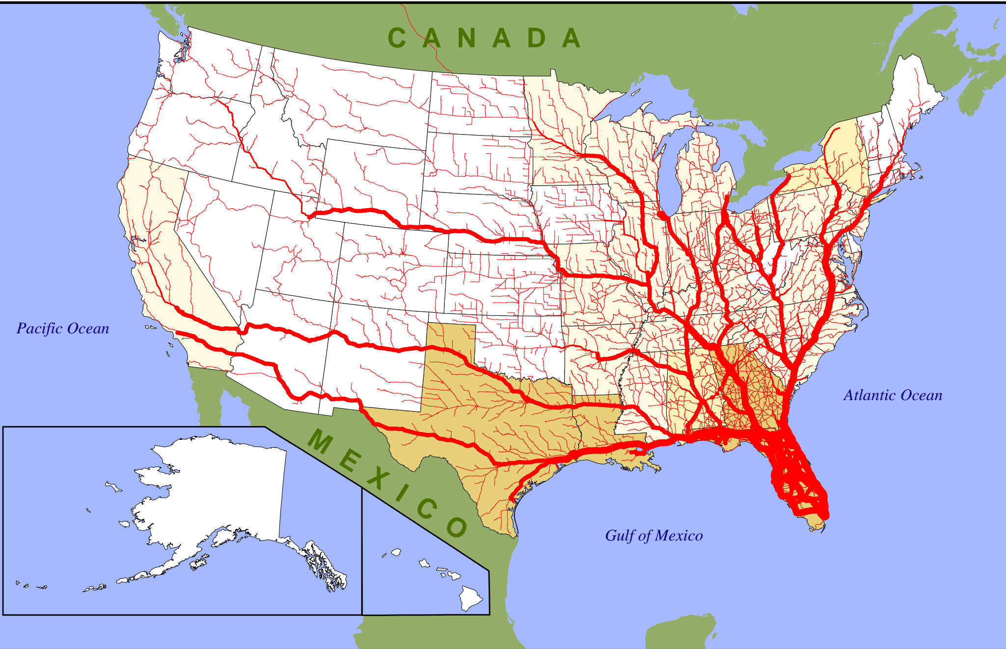
Total Combined Truck Flows (1998)