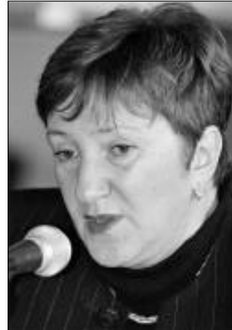
Left: Galina Starovoitova speaking at a news conference in September 1998. Starovoitova, a leading democrat who planned to run for president in Russia’s next presidential elections, was assassinated in November 1998.

Yeltsin has bought political support by steadily selling portions of the state’s powers to strong individuals and groups that