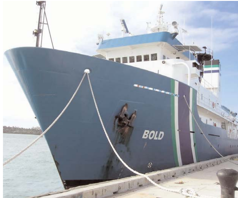
The Ocean Survey Vessel Bold was one of 12 EPA entities evaluated under EPA's SHEM Audit and Evaluation Program in 2006.

EPA's SHEM Audit and Evaluation Program is dynamic. Its scope changes as the Agency's need for self evaluation expands, and in recent years, EPA has initiated efforts to enhance the program. In 2006, EPA produced an Execution Plan, which explains how the improvements will be achieved, and took several concrete steps to set these improvements in motion.