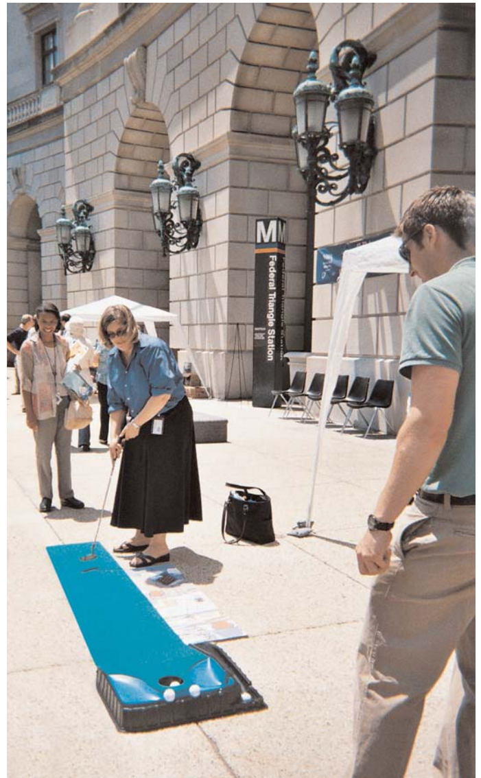
Employees participate in the "Clear the Clutter Putter" game during a safety fair held at EPA Headquarters in June 2006.

In 2006, EPA launched an awareness campaign to educate employees about common workplace hazards, to inform them of EPA's emergency medical response procedures and automated external defibrillator training program, and encourage them to report injuries and illnesses. The Agency launched the campaign in June 2006 at a safety fair held at EPA Headquarters. During the fair, employees engaged in safety- and health-themed games and visited informational booths. Also in 2006, EPA distributed safety and health outreach materials to its major offices and laboratories.