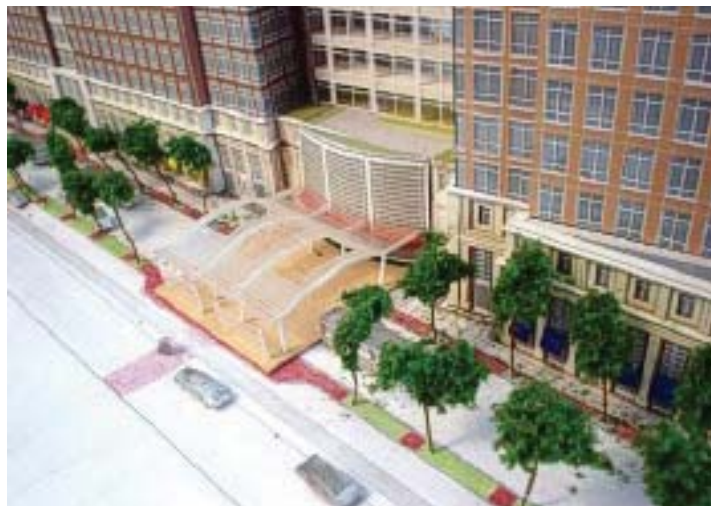
EPA's Potomac Yard Office in Arlington, Virginia, opened in 2006.

EPA's Potomac Yard Office in Arlington, Virginia, also serves as a success story for the Agency's green buildings initiative. The 650,000-square foot facility, which opened for occupancy during the summer of 2006, is already LEED Gold certified, and EPA expects it to receive the ENERGY STAR building label in 2007. In order to exceed the minimum standards for environmental performance,