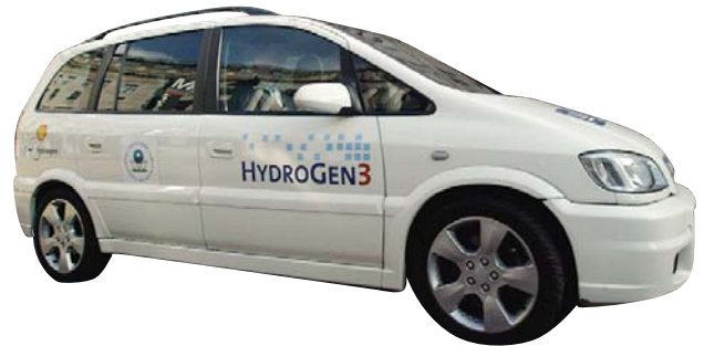
EPA pilot tested General Motors' hydrogen fuel cell vehicle in 2006.

In FY 2006, EPA vehicles used at least 19,229 gasoline gallon equivalents of alternative fuel in lieu of gasoline. Because the Agency believes this estimate is low, EPA introduced improvements to its fuel reporting system in 2006 to ensure the accuracy of future estimates (see sidebar on page 13). Also in 2006, EPA took steps to ensure that alternative fuels will represent a higher proportion of the Agency's future fuel purchases. Toward that end, the Agency mapped out existing E-85 filling stations and issued a policy memorandum to encourage the use of alternative fuels.