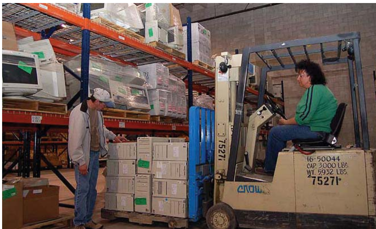
EPA facilities participated in the Electronics Reuse and Recycling Campaign in 2006.

Many EPA facilities participated in the 2006-2007 Electronics Reuse and Recycling Campaign, a challenge issued by the Office of the Federal Environmental Executive to Federal agencies to donate and recycle excess or surplus electronics. During the campaign, these facilities put forth an intensified effort to gather and recycle surplus equipment. EPA’s Research Triangle Park was recognized for its successful recycling of 65,604 pounds of equipment through the campaign. Additionally, the Agency’s Recycling Electronics and Asset Disposition contract provides another mechanism for EPA facilities to recycle outdated equipment in an environmentally sound manner. In 2006, EPA processed at least 96 tons of electronics equipment through this contract.