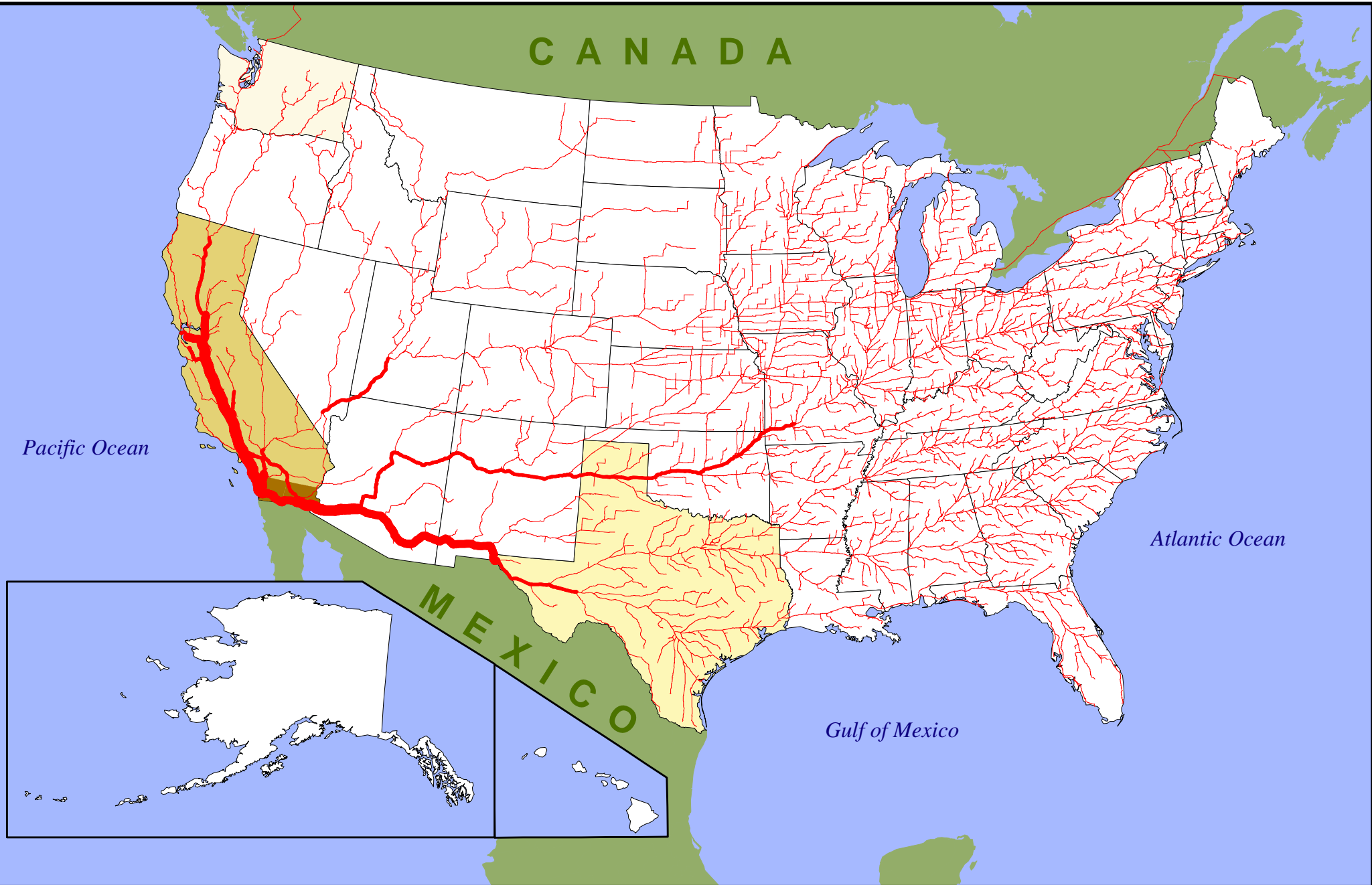
International Truck Flows for Border Crossings (1998)