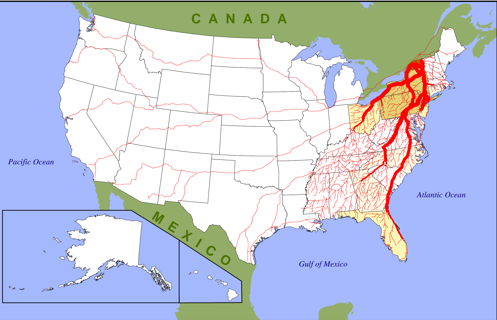
International Truck Flows for Border Crossings (1998)