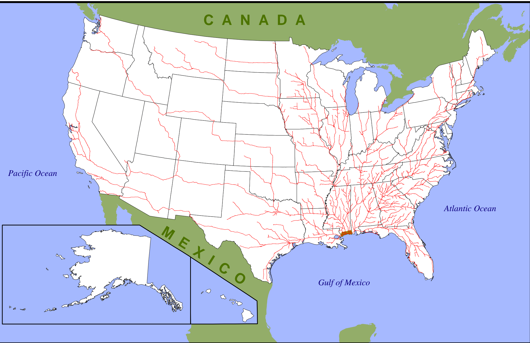
Inland Movement of Maritime Cargo by Truck (1998)