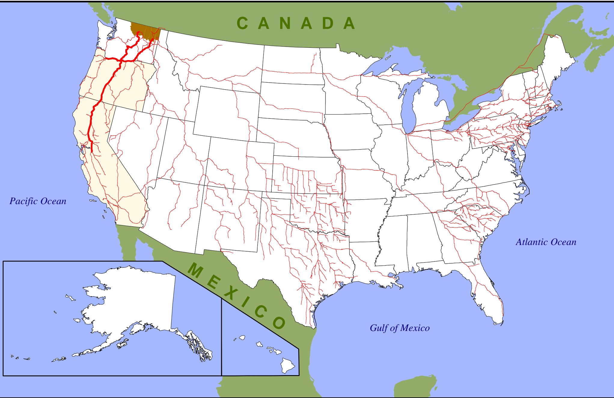
International Truck Flows for Border Crossings (1998)