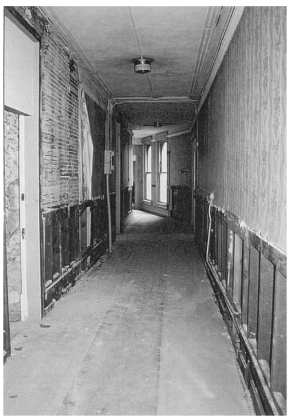
Bostwick 6.15: As seen in this photograph of a corridor, previous owners removed much of the building's decorative woodwork. Fortunately, the material was stored on-site and was reinstalled during the rehabilitation.