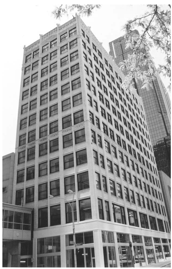
Chambers 6.9: The Chambers Lofts in Kansas City, Mo., includes 50 units of affordable housing. The skyway seen at the left of the photographs existed prior to the current rehabilitation.