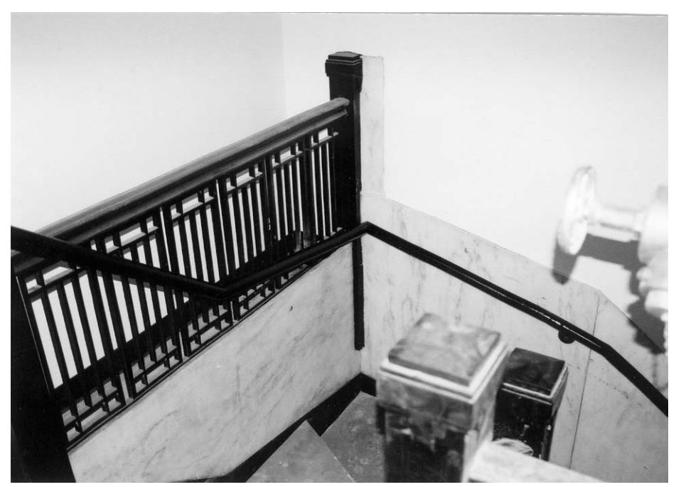
Chambers 6.12: One of the few historic interior features remaining in the building, the historic steel stair was repaired and retained. Windows openings adjacent to the stair, located on a secondary elevation, were enclosed in order to allow the stair to be used as a fire exit.