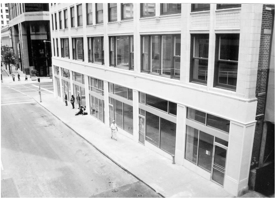
Chambers 6.10: The Chambers Lofts is a mixed-use property, featuring retail spaces in addition to housing units.