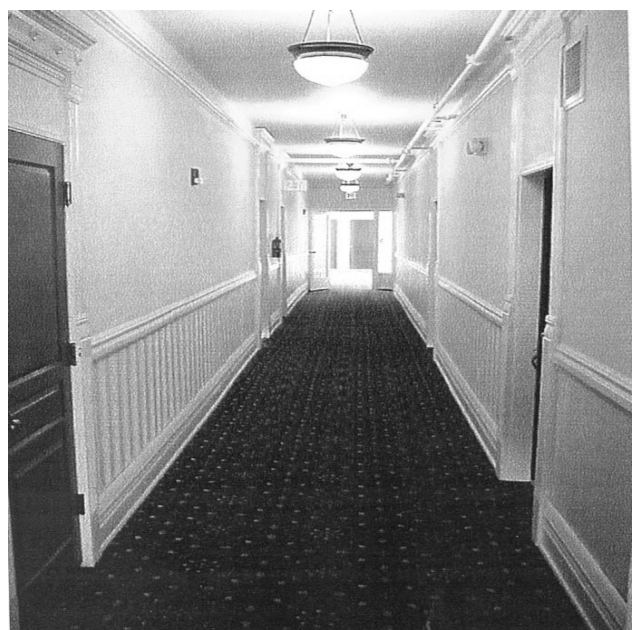
Bostwick 6.16: The corridors of the Bostwick Building were rehabilitated to their historic appearance.