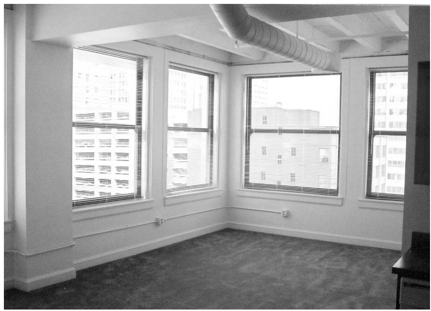
Chambers 6.11: The sparse interiors of the apartment units are consistent with the existing condition of the building prior to the rehabilitation. Historically used as office space, the interiors had been modified over time by numerous tenants.