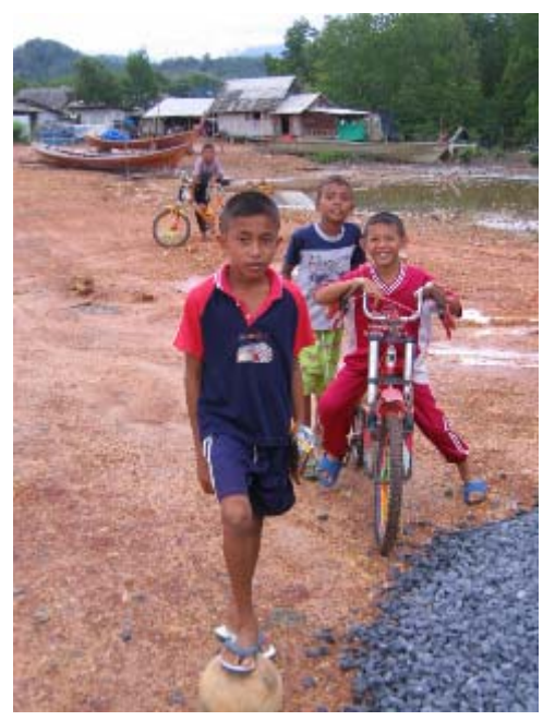
Students now have safe access to their school.