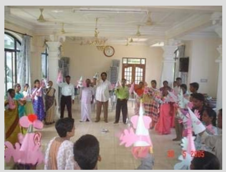
Volunteers participate in three day workshop to educate children through the use of puppetry and games.