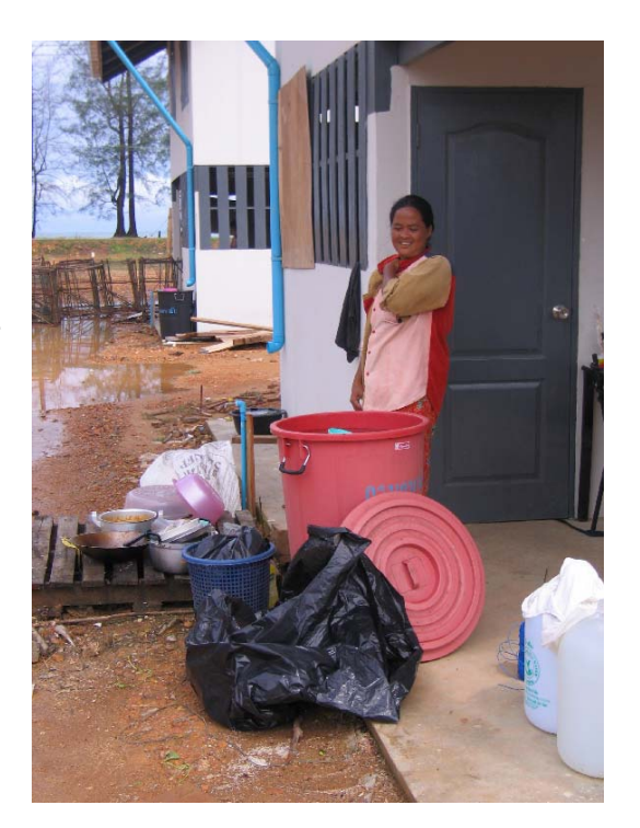
Clean Environment Initiative Program beneficiary proudly displays the new trash baskets outside of her home.

In newly constructed communities for displaced persons, lack of systematic waste removal was a significant challenge to community health. In addition, district resources were constrained by the magnitude of the debris removal. Under USAID's cash-for-work program, a team of 25 persons launched a clean environment initiative, in collaboration with the District Environmental Officer. Locally made trash baskets were purchased and placed strategically in front of homes adjacent to the road for easy collection by trash removal vehicles. District officials, pleased with the villager's desire to contribute to improved practices that protect health, and the maintenance of an aesthetic environment that attracts tourism, agreed to provide weekly solid waste removal.