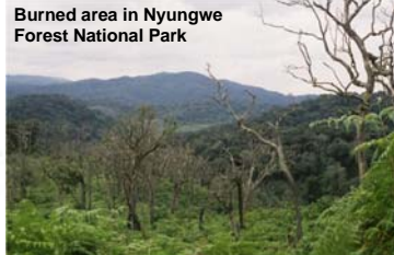
Burned area in Nyungwe Forest National Park