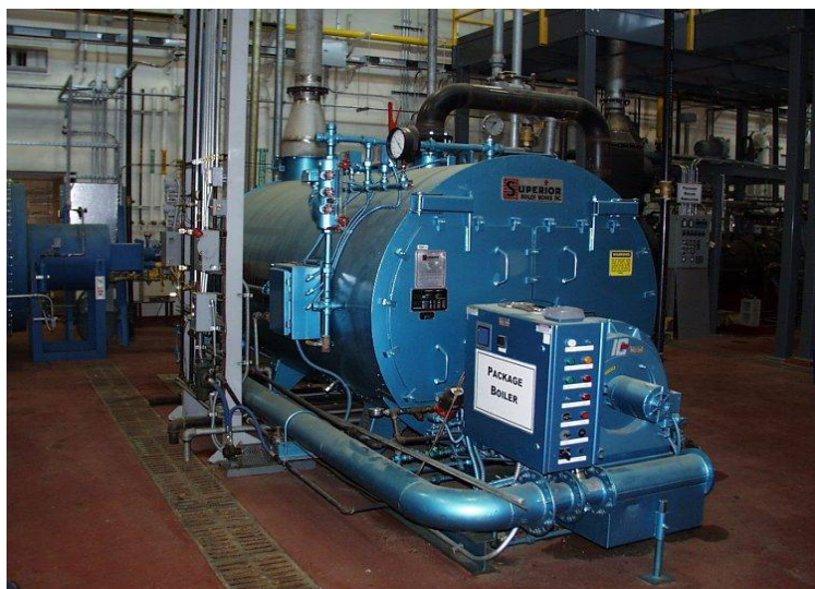
Figure 3-1. Wetback Scotch Marine Package Boiler

A 2.94 thousand British thermal unit per hour, 3-Pass Wetback Scotch Marine Package Boiler (SMPB), manufactured by Superior Boiler Works, Inc., and located at the EPA RTP facility, was used for the verification test. This boiler (Figure 3-1) is capable of firing natural gas or a variety of fuel oils. In this test, the oil burner was used; this burner is a low-pressure, air-atomizing nozzle that delivered a fine spray at an angle that ensured proper mixing with the air stream. The