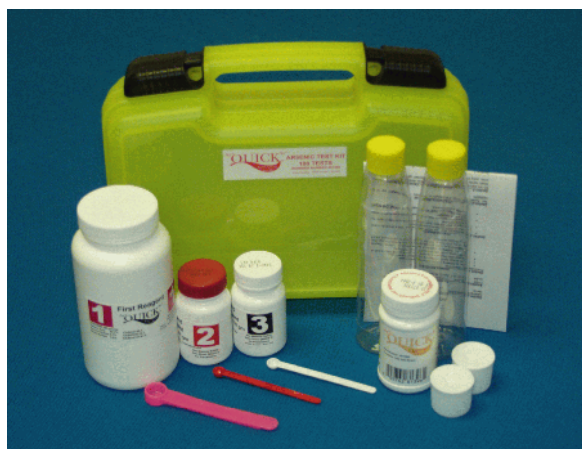
Figure 2-1. Industrial Test Systems, Inc., Quick™ Arsenic Test Kit

The objective of the ETV AMS Center is to verify the performance characteristics of environmental monitoring technologies for air, water, and soil. This verification report provides results for the verification testing of the Quick™ test kit for arsenic in water. Following is a description of the test kit, based on information provided by the vendor. The information provided below was not verified in this test.