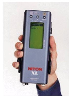
Figure 3-2. Niton portable XRF system.

Detection of the characteristic lead x-rays is achieved using a highly efficient, thermo-electrically cooled, solid-state detector, the Big-Area Silicon PIN-diode (BASP). Signals from the BASP detector are amplified, digitized and then quantified via integral multichannel analysis and data processing units. Sample test results are displayed in total micrograms of lead per dust-wipe.