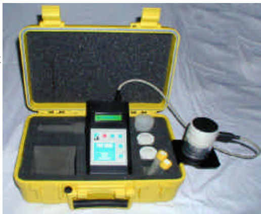
Figure 3-1. MTI's PDV 5000 system

The PDV 5000 system is a new type of 3 electrode device. Instead of liquid mercury as the electrode, this device uses a glassy carbon electrode that is plated with a very thin film of Mercury. (Mercury Thin Film Electrode, MTFE) This is carried out at the beginning of an analytical run and lasts for between 10 and 30 subsequent analyses. The Mercury is contained as a salt in the supporting buffer used. This means only a very small amount of Mercury is used and ensures the operator never comes into contact with liquid Mercury. The amount of Mercury used per analysis is measured in parts per billion. If however the analysis is for Arsenic, Selenium or Mercury, the glassy carbon electrode is given a Gold film. Ease of use has been the primary objective in the design. A simple, menu driven software allows the user to select the metal and concentration range of interest. Analysis time is dependant on the metal concentration, but ranges from a few minutes to 20 minutes for an ultra low concentration. The initial calibration can be used for many subsequent 'unknown' analyses without the need for recalibration.