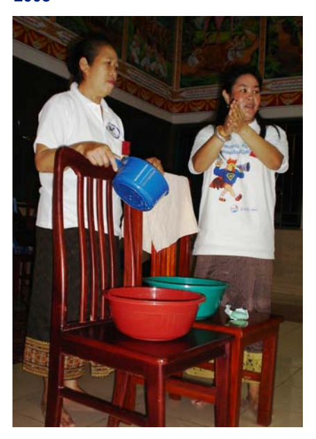
USAID supports community behavior change programs in Laos that teach methods to prevent the spread of avian influenza.