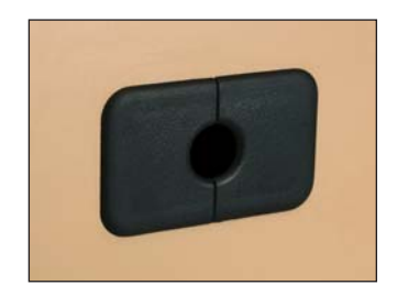
Wire Management & Access