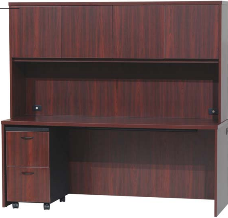
Credenza Desk with Upper Storage and Mobile Pedestal shown in Mahogany