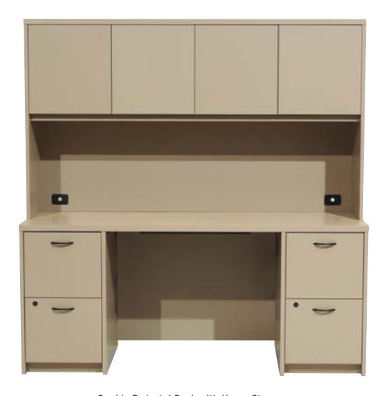
Double Pedestal Desk with Upper Storage shown in Smoke

With its vast array of unique configurations, MELODY is ideal for creating an efficient and impressive environment in which to conduct business.