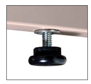
Hex Nut Leveling Feet