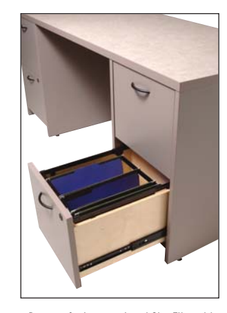
Drawers for Letter or Legal Size Files with Optional Hanging Bars (sold separately)