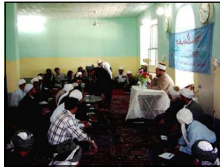
Workshop held on terrorism in Iraq