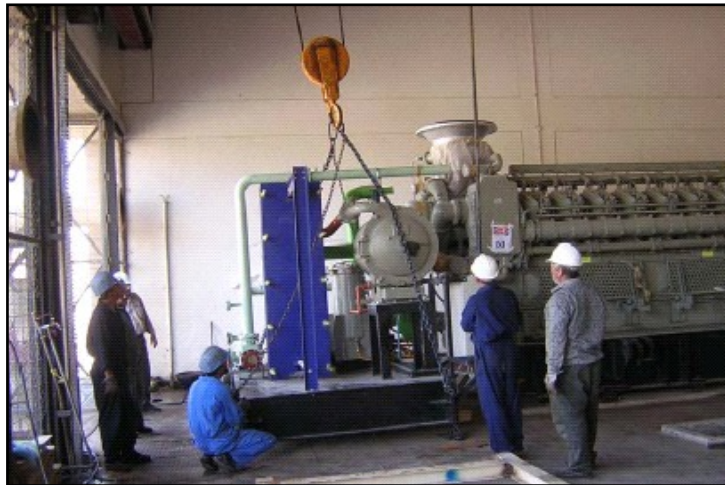
Workers aligning oil cooler for a new generator

and back-up power. The project includes the installation of two new back-up generator sets generating 5 MW each and the refurbishment of a primary generator, which has the capacity to produce 8 MW. The project is also repairing the 11 kv system which distributes power around the airport.