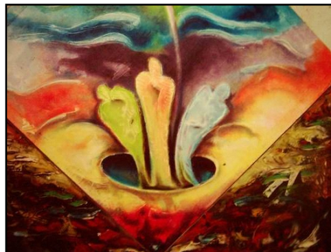
Artwork from a USAID funded exhibition in southern Iraq