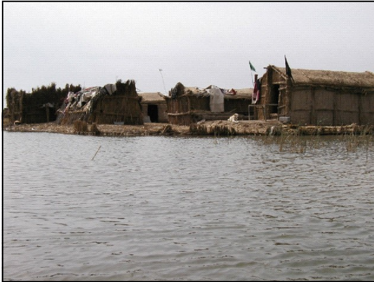
A settlement in Iraq's marshlands

USAID's marshland restoration initiative works with local residents in support of marshland restoration and the social and economic development of marsh communities.