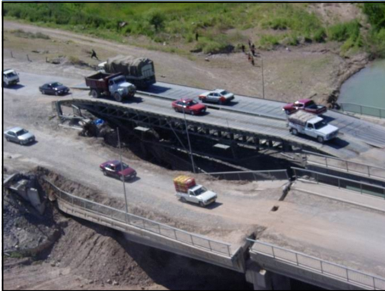
The reconstruction of the Khazir Bridge, a four-lane bridge in northern Iraq, was complete in early April.

USAID's goal is to rebuild major transportation routes that were damaged or neglected in order to restore the flow of goods and services.