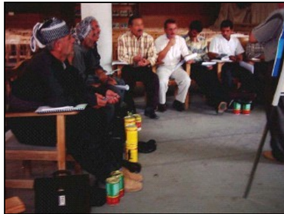
A workshop for farmers in Arbil Governorate