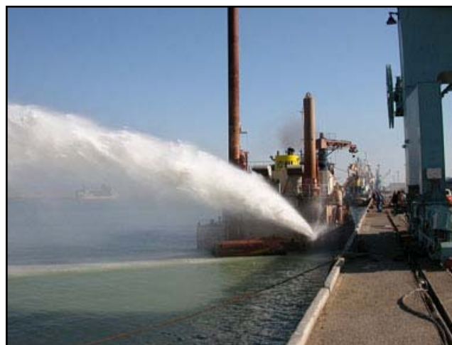
Dredger at Umm Qasr Seaport, rehabilitated by USAID

USAID's goal was to rehabilitate and improve management at the port, manage port administration, coordinate transport from the seaport, and facilitate cargo-handling services such as warehousing, shipment tracking, and storage.