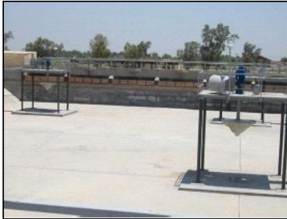
A wastewater treatment plant in central Iraq