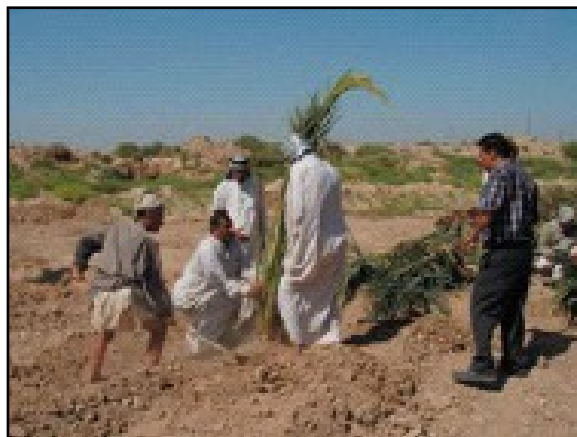
Planting date palm offshoots in Iraq's marshland areas