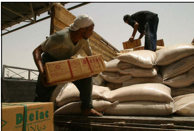
Workers load food supplies from a World Food Program warehouse in Umm Qasr, for distribution through local neighborhood agents. USAID supports the program which provides basic food rations to a large number of needy families in Southern Iraq.

As part of the U.S. Government's assistance plan, USAID played a leading role in helping to avert a humanitarian crisis in Iraq by providing assistance to the United Nations' World Food Program through USAID's Office of Food for Peace. Having averted a food crisis immediately following the conflict, USAID advisors continue to assist with the management and distribution of food rations for all Iraqi citizens.