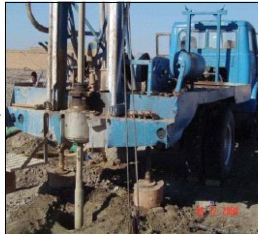
Well drilling for a rural water treatment plant.

Work is 18 percent complete to rehabilitate two irrigation pump stations and one drainage pumping station in the Euphrates River Basin in Babil Governorate. These pump stations are essential to supply adequate drainage and reliable irrigation for the highly-productive agriculture of this area which provides Baghdad with fresh produce. The pumping stations are also used to regulate water levels and reduce damage from flooding. Site assessments for this project were completed last summer and it was determined that each station needs pumps and motors replaced. The project is scheduled to be completed in July 2005.