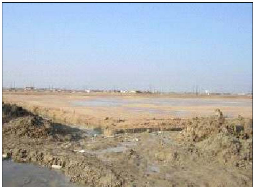
Fill and preparation work at the hospital site is complete

This project includes furnishing all labor, equipment, materials, security, housing, logistics, transport, and other resources needed to plan and build the hospital. The building's design takes into account the structural and functional requirements for conference rooms, offices, and student dormitories.