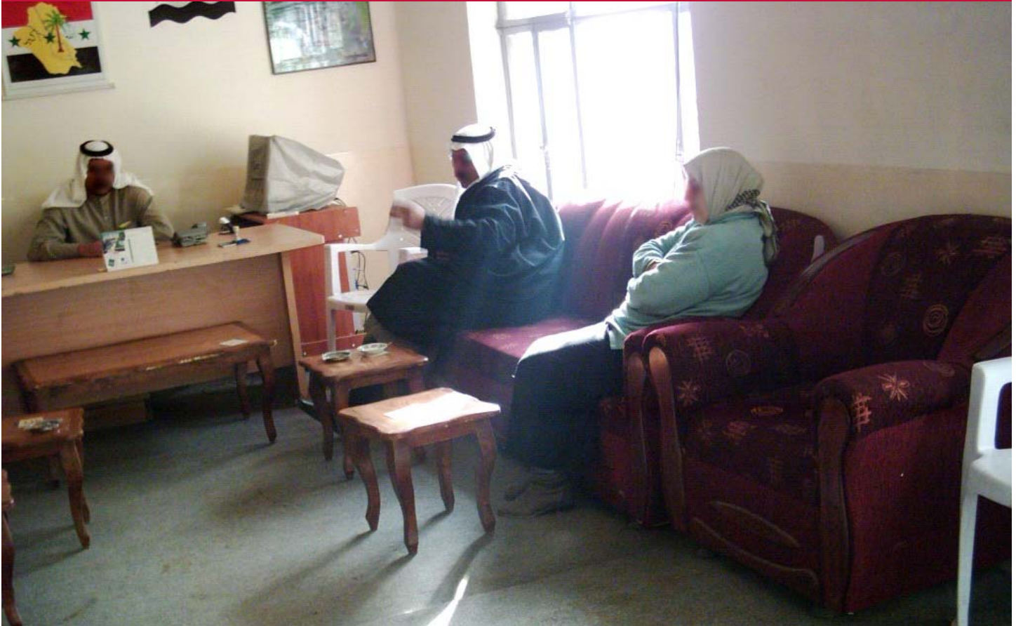
A local farmer's union's office renovated with the assistance of USAID's Iraq Transition Initiative