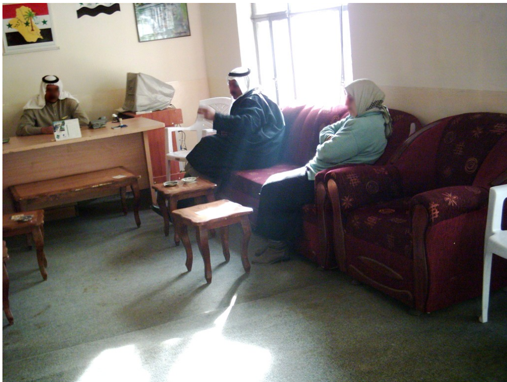
A renovated office of a local farmer's union.

Another ITI grant rehabilitated and equipped the meeting hall and offices of a northern Iraqi local farmers' union, and provided furniture. In order to resume activities and decrease ethnic tension, union members elected administrative staff representing all ethnic groups to manage the union. The assistance of this grant will enable the farmers' union to better serve their members and the local farming community. ITI assistance has jumpstarted the union's interest in other activities, including its participation in USAID's Local Governance Program democracy dialogue activities.