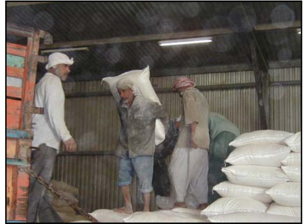
Agents in Iraq's public distribution system transport food to warehouses throughout Iraq.

Agriculture – Objectives include: expanding agricultural productivity, restoring the capacity of agroenterprises to produce, process and market agricultural goods and services, nurturing access to rural financial services and improving land and water resource management.