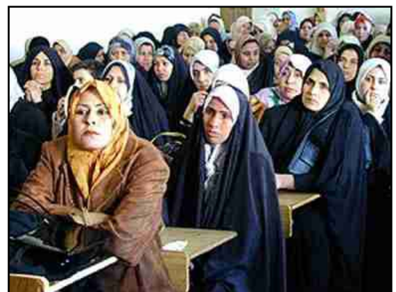
Teachers and school administrators at a Babil democracy presentation