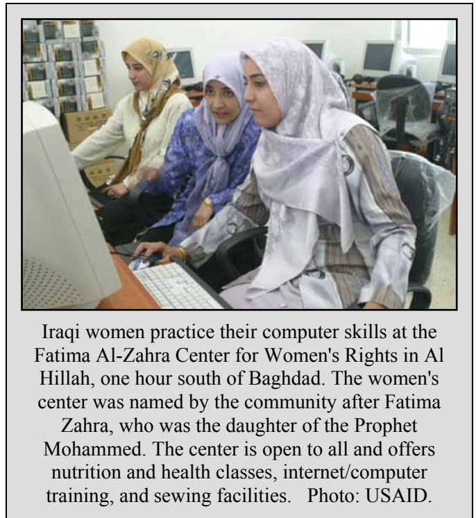
Iraqi women practice their computer skills at the Fatima Al-Zahra Center for Women's Rights in Al Hillah, one hour south of Baghdad. The women's center was named by the community after Fatima Zahra, who was the daughter of the Prophet Mohammed. The center is open to all and offers nutrition and health classes, internet/computer training, and sewing facilities.