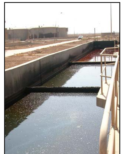
Raw sewage at Kerkh Sewage Treatment Plant