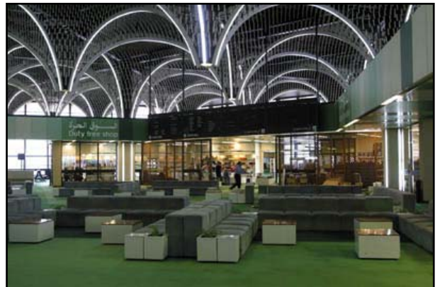
Baghdad International Airport has been refurbished and repaired with assistance from USAID and CPA.

Bridges, Roads, and Railroads -- Objectives include: rehabilitating and repairing damaged transportation systems, especially the most economically critical networks.