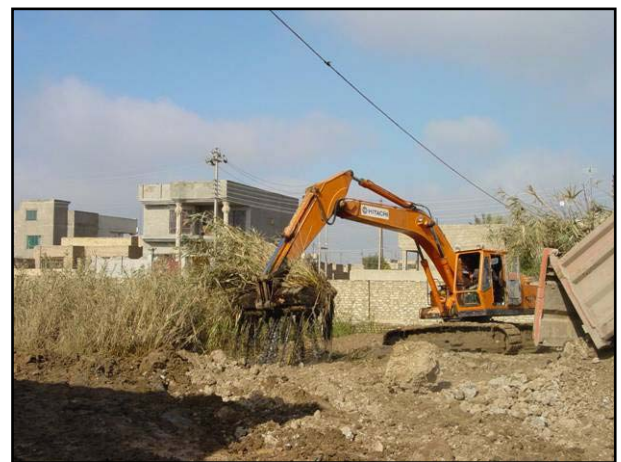
A bulldozer clearing the shrubbery and clearing the swamp at the Ibn Sina Secondary School in Al Hillah.