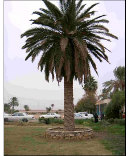
A date palm at the University of Baghdad

Marshlands – Objectives include: construct environmental, social and economic baselines for the remaining and former marshlands; assist marsh dwellers by creating economic opportunities and viable social institutions; improve the management of marshlands and expand restoration activities