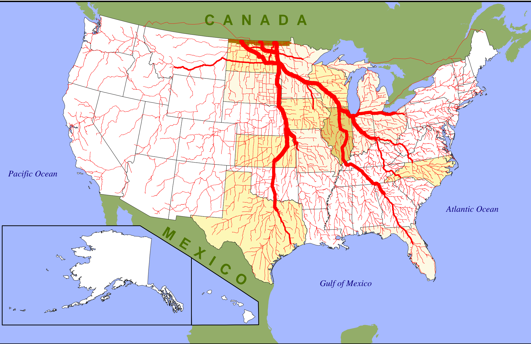
International Truck Flows for Border Crossings (1998)