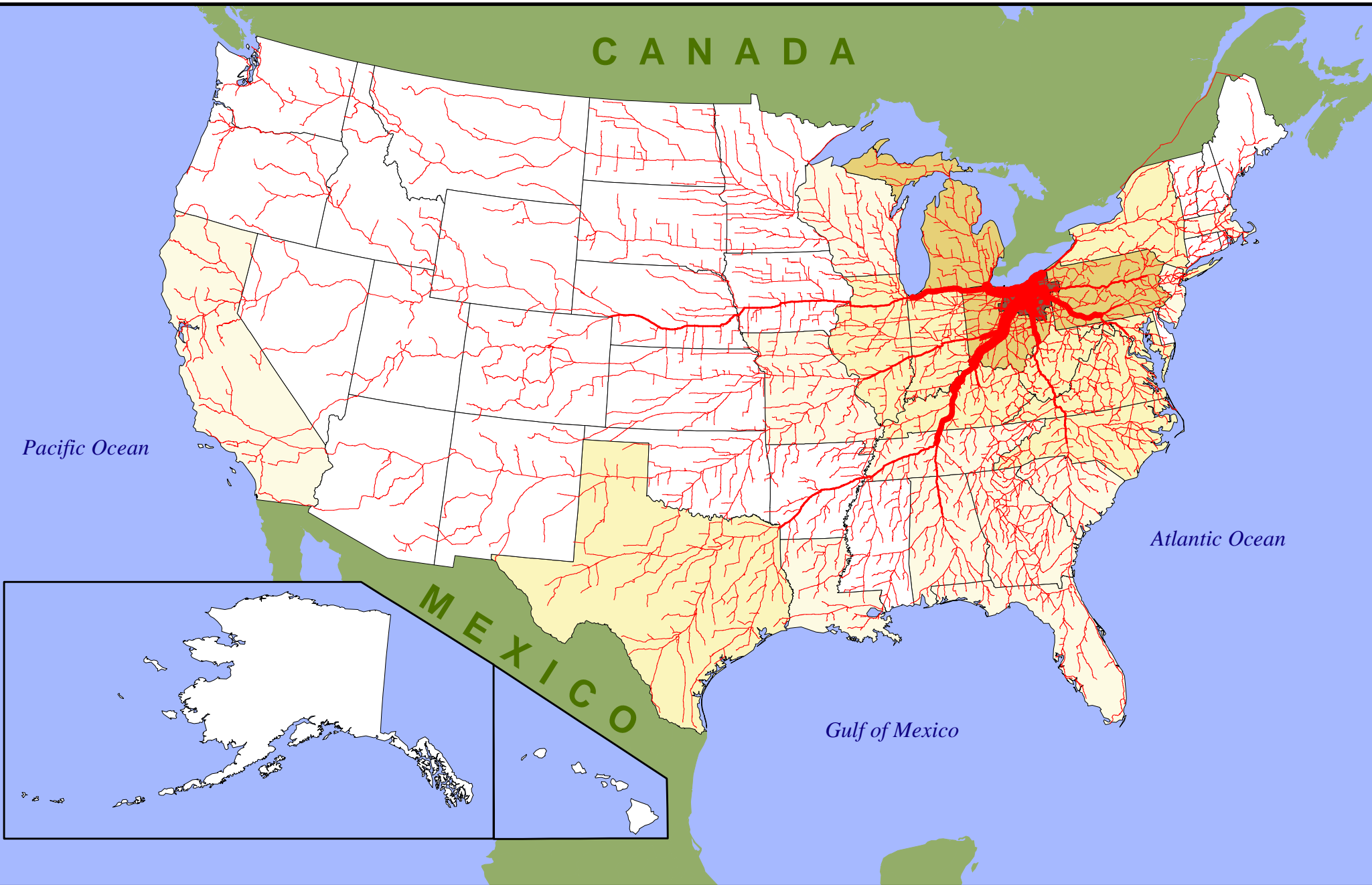
Total Combined Truck Flows (1998)