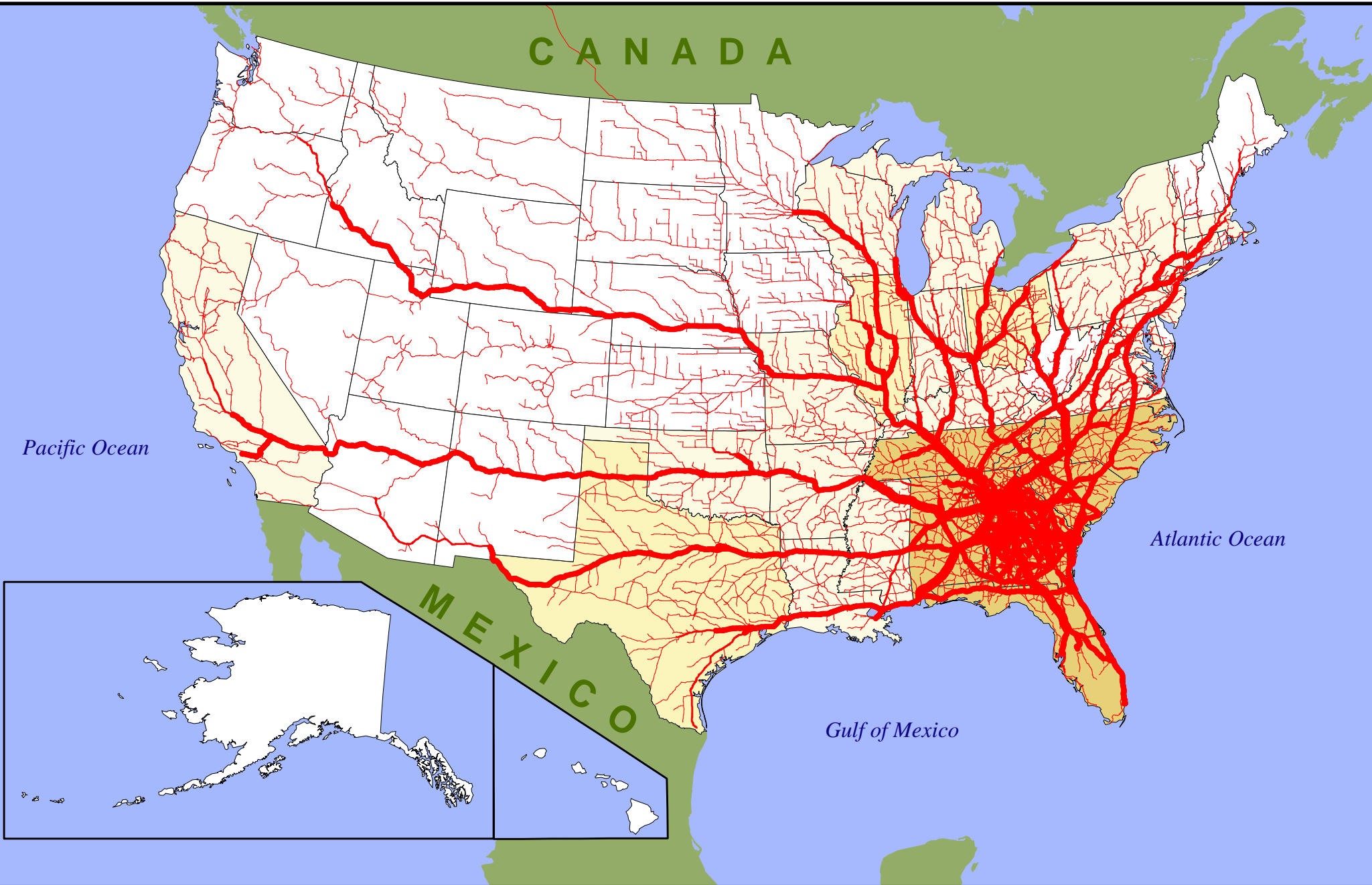
Total Combined Truck Flows (1998)